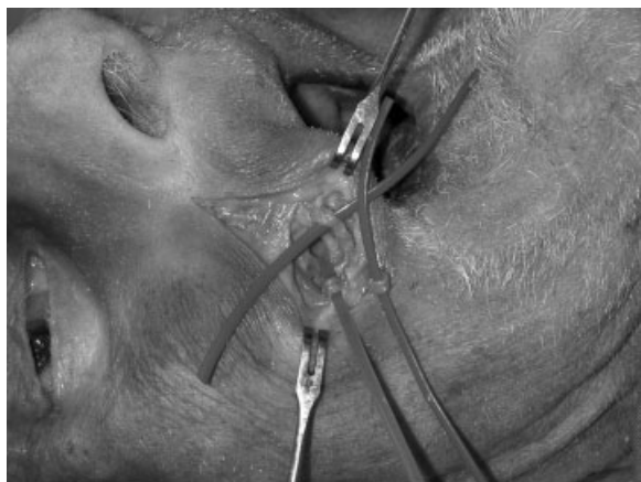
Figure 1 After incision of the nasolabial fold, the facial artery and vein are dissected. Two red vessel loops were used to identify the facial artery at the distal and the proximal end of the dissection. A blue vessel loop identifies the facial vein.

In all 25 sides, the artery was located underneath the zygomaticus muscle. The zygomaticus and levator angularis oris were connected to form a broad muscle in three sides. The facial vein was found within Bichat's fat pad in 20 sides and was situated deeper, either besides or beneath Bichat, in three. The buccal fat pad could not be located in two sides.