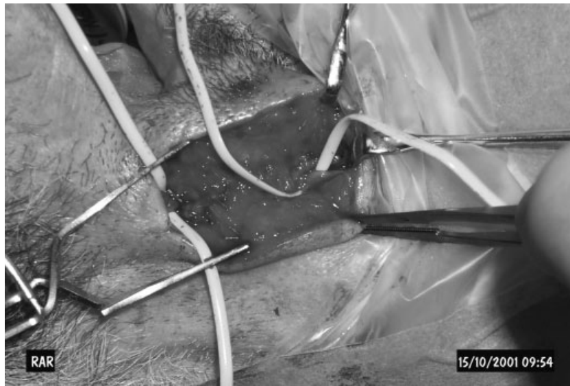
Figure 3 Clinical case in which the facial vessels were used as receptor site to reconstruct the maxilla with a vascularized humeral bone graft. The left vessel loop identifies the artery, the right vessel loop the vein. Further dissection was possible; however, the lengths of the artery and vein were sufficient to bring them superficial and perform the anastomosis.

site. The mean length of the dissected artery and vein was 28 mm ( \pm 11 SD) and 19 mm ( \pm 6 SD), respectively. The difference in length between the artery and vein was caused by their location. Because the artery was located more superficially, it was easier to dissect and could be dissected distally until the diameter was no longer fit for a reliable anastomosis. The vein, however, was situated in a deeper layer and, because of this, was only dissected until its length was sufficient to bring it superficial. This was done to minimize damage to the surrounding tissue. In the cases in which the length of the vein was not sufficient, the overlying zygomaticus muscle could be further divided to ensure a further dissection of the vein.