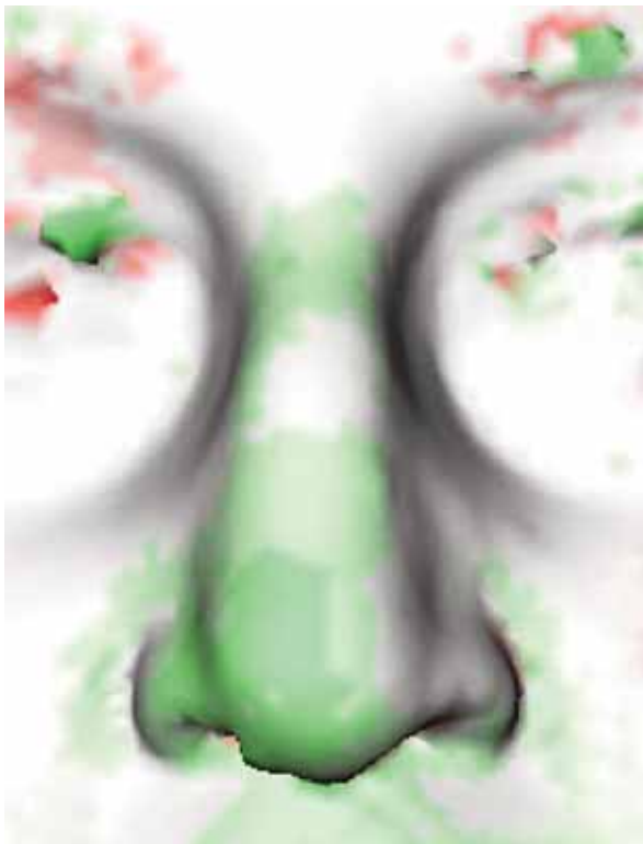
Figure 2. Patient with preoperative saddle nose deformity. Hump reduction was combined with dorsal onlay graft resulting in an increased nasal dorsal volume, shown as green discolouration of the nasal dorsum.

In aesthetic rhinoplasty patients indications can be roughly divided into: reduction rhinoplasty, in which the nose is made