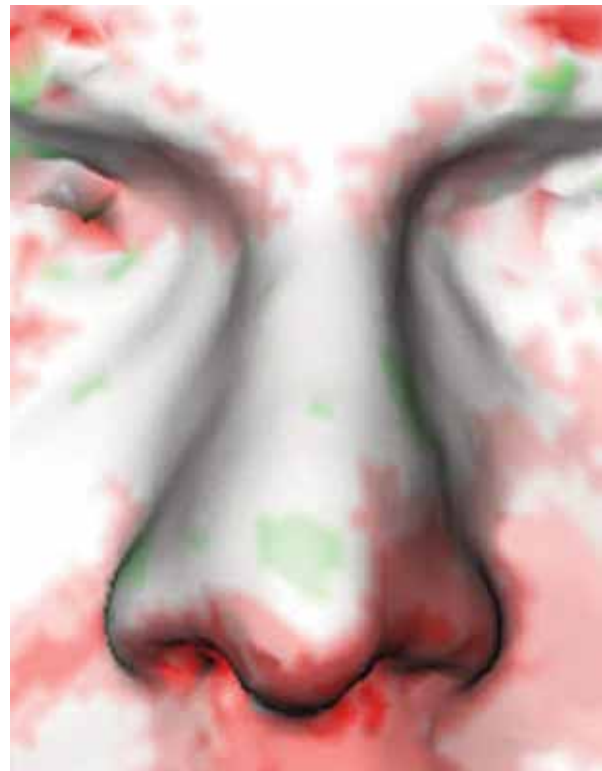
Figure 3. Patient with polly beak deformity and relative pseudo hump. The increased rotation of the tip is detected as a volume increase in the supratip region (green discolouration) and a volume decrease in the infratip region (red discolouration).