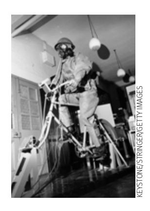
RESEARCH, pp 749, 754

Risk is not increased, but some health questions remain