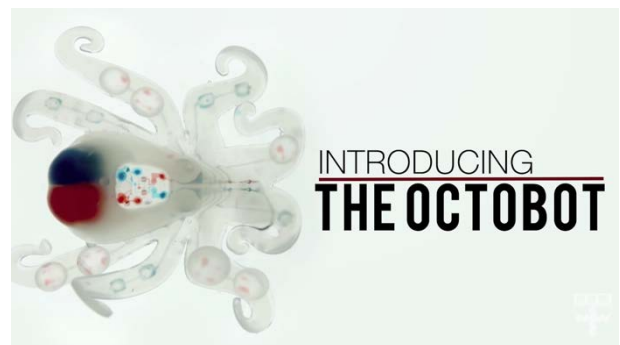
Figure 1: Still image from the opening shot of the first video.