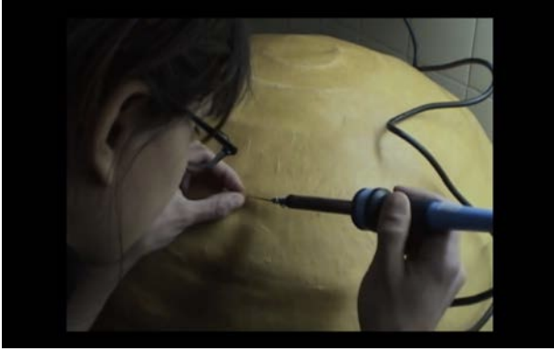
Figure 4: Still image from the video: Holes are made.

6.47: The semi-sphere is seen lying on a plinth(?) it is lifted over to reveal wires, which the woman is seen twisting together (the sensors were “connected in parallel...”). The microcontroller is placed in a small plastic suitcase-like enclosure that looks to be fixed atop a baking tin. It activates four pumps, hidden inside [the] pedestal in [a] reservoir with distilled water.