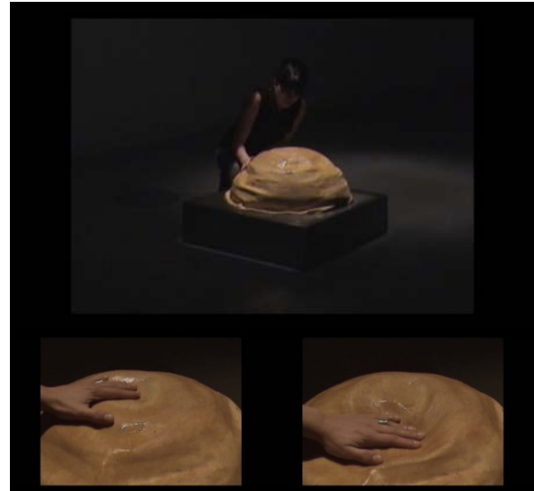
Figure 6: Still images from the video: Touching unfolding between the artist and the robot.

And different choreographies of touching unfold: a slow gentle caress, a surface smear, a mechanical folding of layers, an assembling of the skin-like material. The robot responds by sweating but also with a distinct vocabulary of bodily gestures afforded by its elasticity and structural configuration: bending in, popping back out immediately or slowly, folding inwards, lying in wait of what’s next. The robot’s response to the touch engenders the next touch, which engenders another response from the robot – and so on, it seems. A sense of reciprocity emerges.