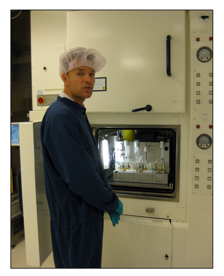
Figure 4. In the synthesis lab, radioactive substances from the cyclotron are synthesised with biological agents.

PACS is connected to workstations where the clinicians of the department interpret and review the PET-CT images for diagnostic purposes. This process also incorporates a database for the storage and retrieval of the images and associated text.