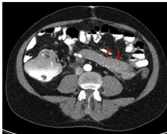
Fig 2. Computed tomography scan 3 weeks after the transplant, confirming the pancreas graft in the "transverse" position (red arrows).

A midline incision from the pubis to 3 cm above the umbilicus was performed. The transverse pancreas technique was accomplished by using 2 Satinsky vascular clamps, and the inferior vena cava (IVC) was totally clamped and an appropriate length venotomy was