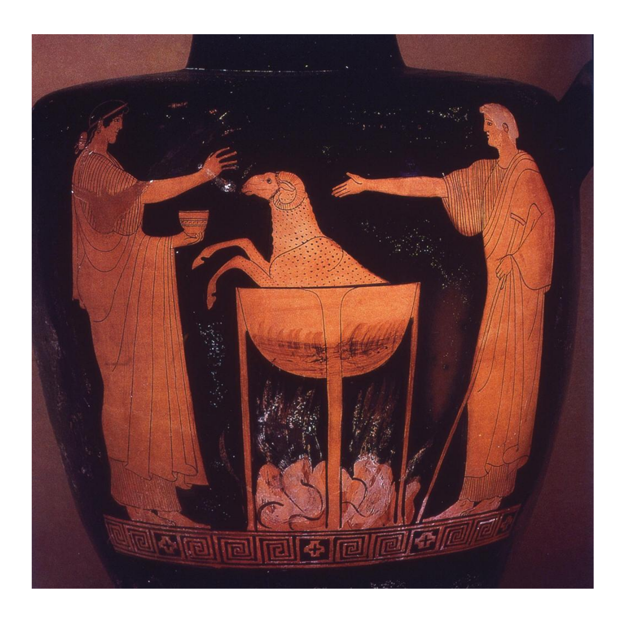
Figure 3. Medea and the Ram; ca. 470 B.C.E. British Museum.