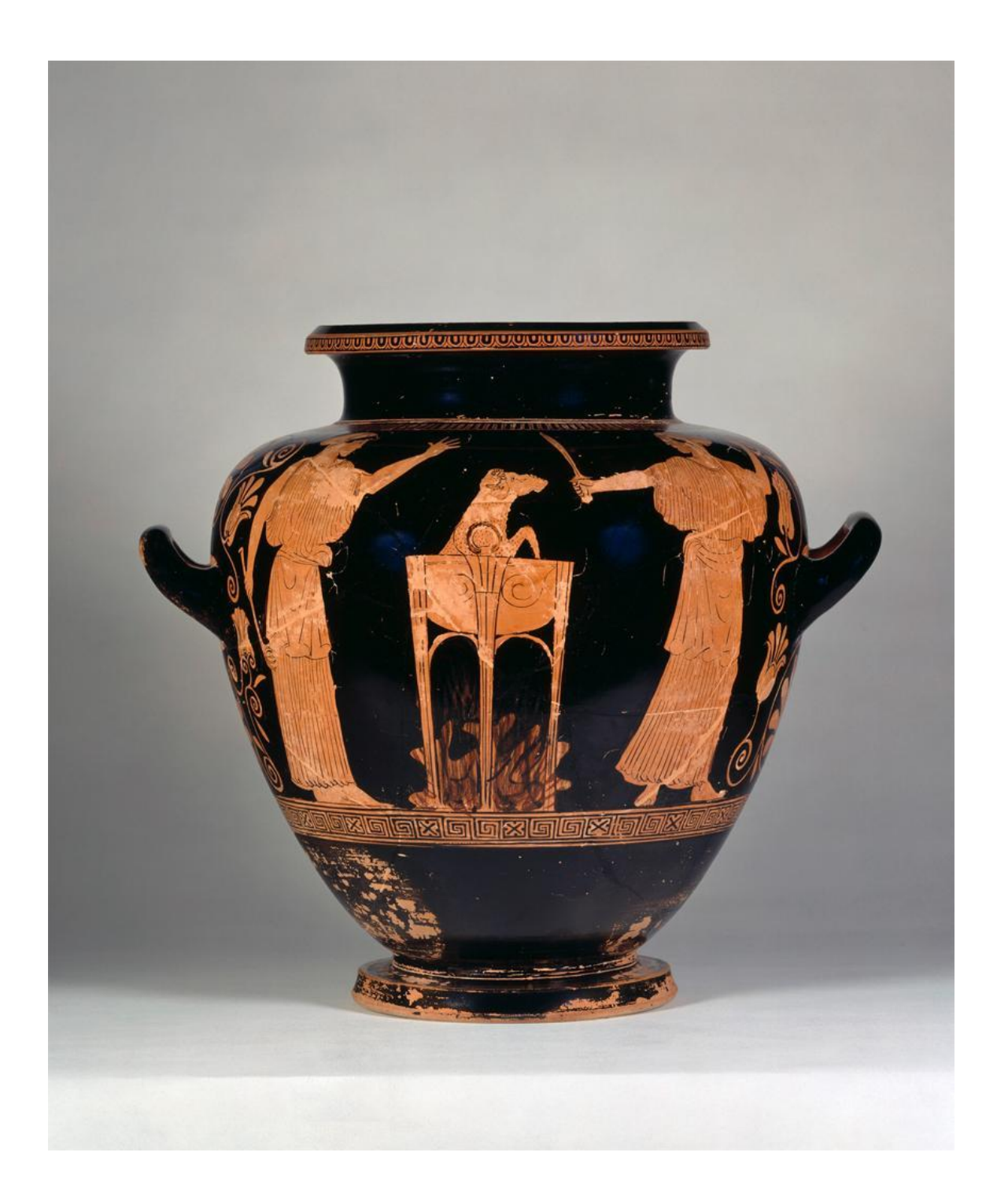
Figure 4. Medea and Peliades; ca. 470 B.C.E. Staatliche Museen zu Berlin (75.683).