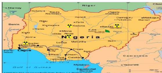
Fig.2. Map showing locations and transport routes of radioactive sources

Nuclear security and safeguards in Nigeria. Regulatory oversight is one of the core functions of the Nigerian Nuclear Regulatory Authority (NNRA) as provided by the Act of 1995, which establishes the Authority [7]. Nigeria signed and ratified the Convention on Physical Protection of Nuclear Material and Nuclear Facilities (CPPNM/NF) which came into force in May 2016. In order to domesticate the provisions of the CPPNM, the NNRA commenced the development of Regulations on Physical Protection of Nuclear Material and Nuclear Facilities in 2013. In year 2013/2014 and 2015/2016 under review, the NNRA conducted depleted Uranium (DU) survey across Nigeria as part of country's commitment with respect to its obligation to the IAEA on nuclear material accounting and control (NMAC) [8].