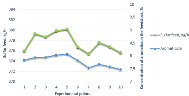
Fig. 1. Dynamics of the change in sulfur supply for combustion from the content of aromatic compounds in raw materials

The study used polyfluorene derivatives synthesized in the laboratory of polymer nanomate-