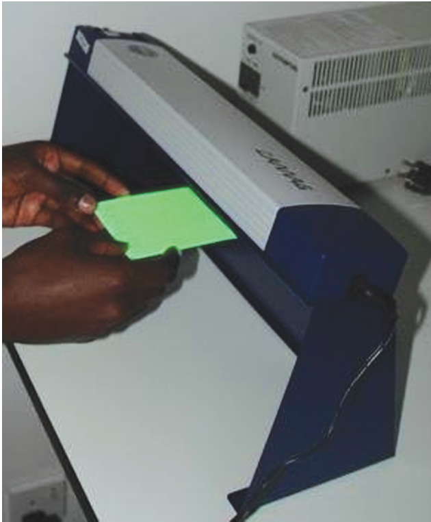
Figure 3. Determination of spot intensity under UV light

:1), and the median time from the last ingestion of medication and to sample collection was 3.40 h (interquartile range, 2.52–4.37 h). Six subjects had a ratio of saliva nevirapine concentration to plasma nevirapine concentration >1.00 (range, 1.25–15.68); the median time from last ingestion of medication to sampling for these 6 subjects was 1.19 h (interquartile range, 0.85–1.74 h).