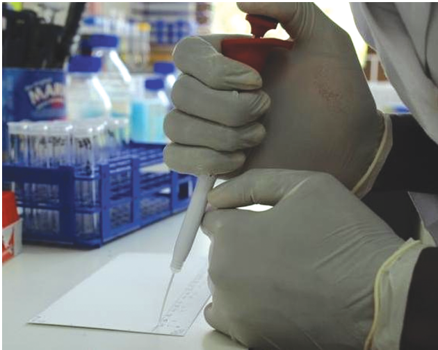
Figure 1. Preparation of thin-layer chromatography sheet with saliva samples.

is one-half of the cutoff value for plasma specimens (3.0 mg/L) [3]. The rate of false-positive results was defined as the proportion of subtherapeutic saliva concentrations of nevirapine (i.e., <1.5 mg/L), as determined by HPLC [6], that were reported to be therapeutic on the basis of TLC of saliva specimens. The rate of false-negative results was defined as the proportion of therapeutic saliva concentrations of nevirapine ( \geq 1.5 mg/L), as determined by HPLC [6], that were reported to be subtherapeutic on the basis of TLC of saliva specimens.