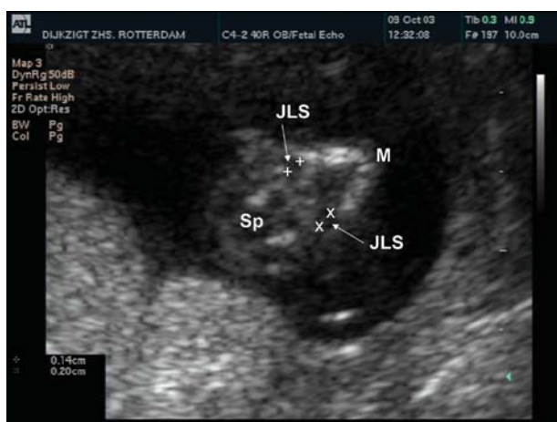
Figure 1 Transversal plane through the mandible (M) and spinal cord (Sp). Bilateral normal size jugular lymphatic sac (JLS). Measurement of JLS is done in an anterior-posterior direction.

In this subset the 95 th percentile for NT size was 2.5 mm. Women were therefore considered “test-positive” if the NT size was above this level. The JLS were detectable in 23% (97/406) women of the study group. In the same subset of 384 uncomplicated pregnancies