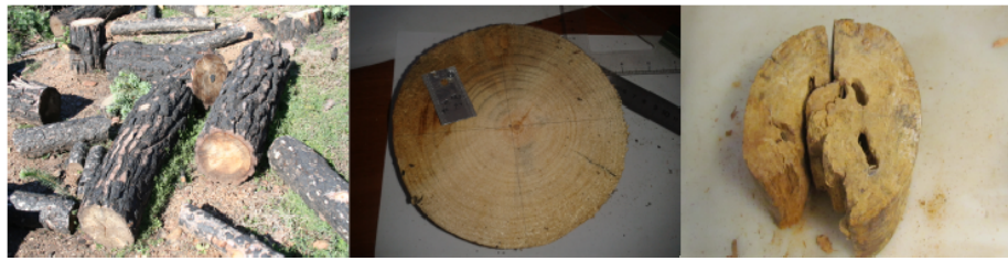
Figure 1. Wood samples used in the study. Left: standardized 75 cm length experimental logs that were spread through the three elevations (plots) since the beginning of the experiment (March–April 2006); a metal tag can be observed in one of the logs. Center: Wood disc from an experimental log after some years (two in this case) of decomposition. Right: a highly decomposed wood disc after 10 years; when discs showed a high degree of fragmentation, as in this case, we used the two longest available arcs of the circle to find the perpendicular bisectors and the center of the disk at their intersection, from which the diameter was measured.