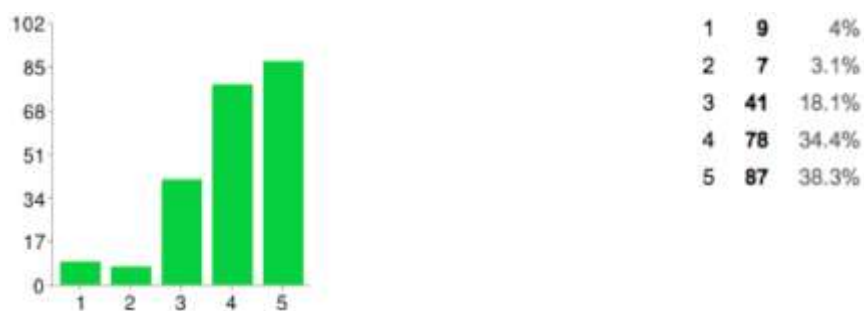
Fig. 16. LQ. V6 Frequency.