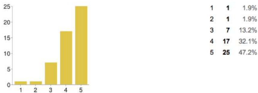
Fig. 12. PQ. V4 Frequency.