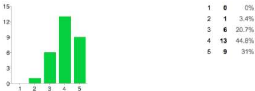
Fig. 2. FQ. V1 Frequency.