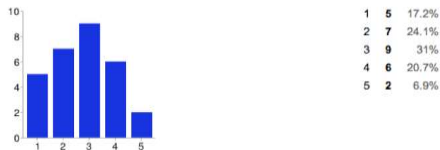
Fig. 30. FQ. V12 Frequency.