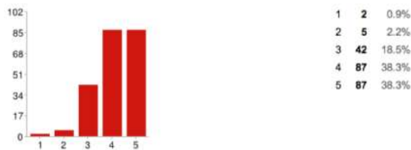
Fig. 10. LQ. V4 Frequency.