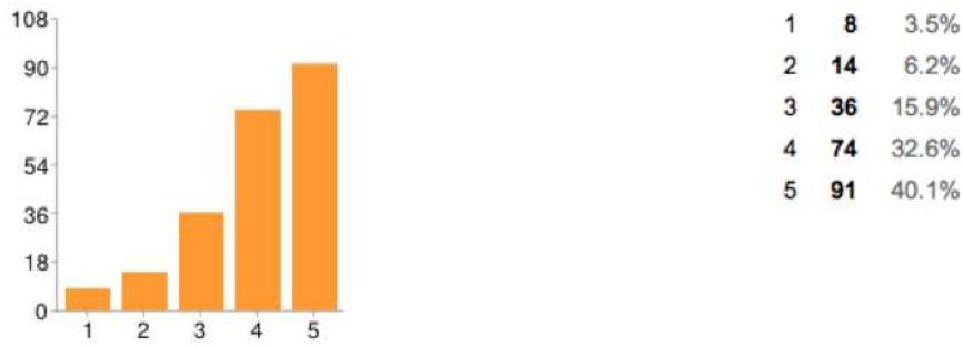
Fig. 19. LQ. V7 Frequency.