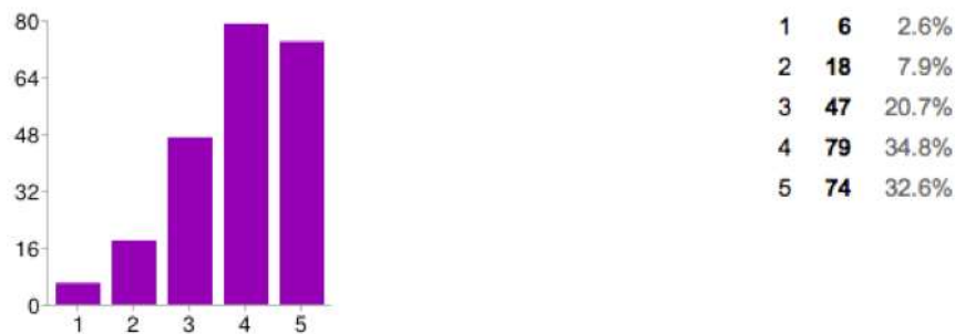
Fig. 1. LQ. V1 Frequency.