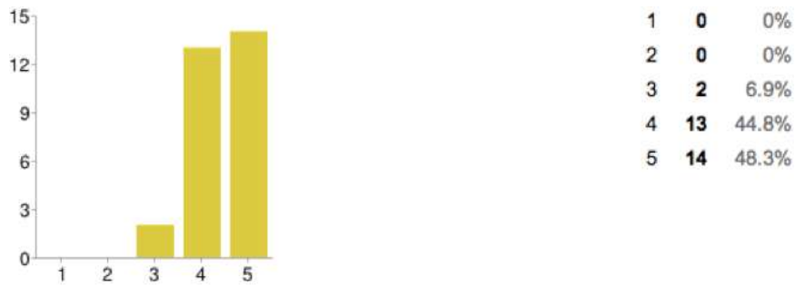
Fig. 23. FQ. V8 Frequency.