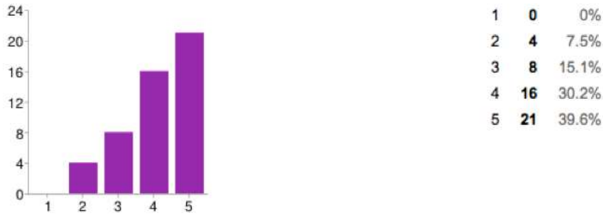
Fig. 3. PQ. V1 Frequency