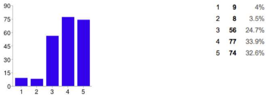
Fig. 4. LQ. V2 Frequency.