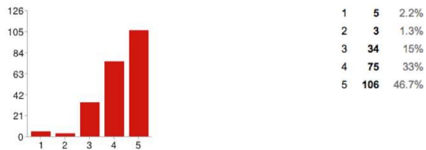
Fig. 22. LQ. V8 Frequency.