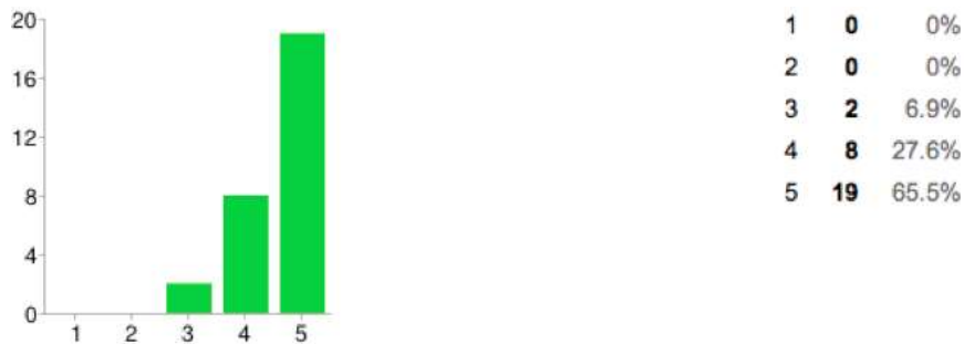
Fig. 14. FQ. V5 Frequency.