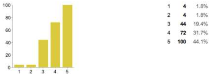
Fig. 25. LQ. V9 Frequency.