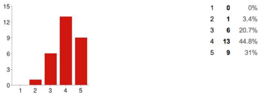
Fig. 20. FQ. V7 Frequency.