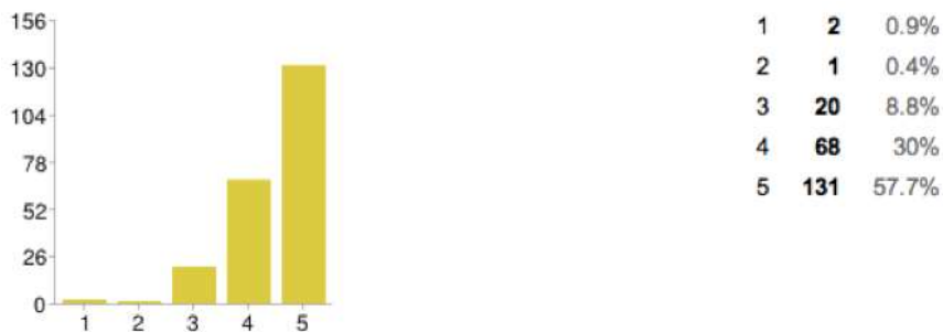
Fig. 13. LQ. V5 Frequency.