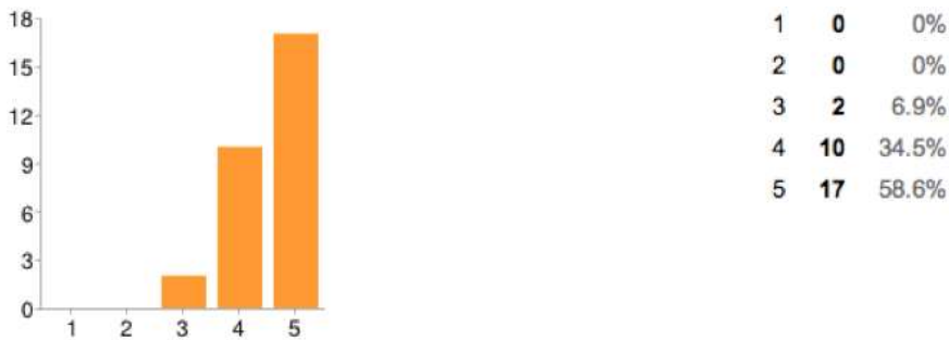
Fig. 5. FQ. V2 Frequency.