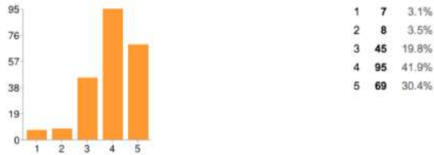
Fig. 7. LQ. V3 Frequency.