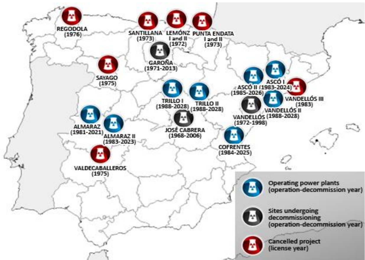
Fig. 1 Nuclear power plants licensed in Spain

Paralleling this nuclear boom, the FAE was founded in 1962 to bring together industries involved in the nuclear sector and to increase their penetration of the Spanish energy market (Fórum Atómico Español 1962: 2-10). The 50 founding companies included the main electric companies in Spain (i.e., Hidroeléctrica Española, Iberduero, Electra de Viesgo, Endesa, Hidroeléctrica del Cantábrico, Unión Eléctrica Madrileña, Compañía Sevillana de Electricidad, and Hidroeléctrica de Cataluña), new companies established to manage Spanish nuclear facilities (i.e., Cenusa and Nuclenor), manufacturers of nuclear components and systems (i.e., Construcciones Nucleares and Sociedad Española de Construcciones Babcock y Wilcox), private engineering companies (i.e., Tecnatom and Estudios y Proyectos Eléctricos), the Spanish Nuclear Energy Board, insurance companies (i.e. Unión Iberoamericana and La Estrella), and a bank (Banco de Vizcaya) (Fórum Atómico Español 1962: 18-20).