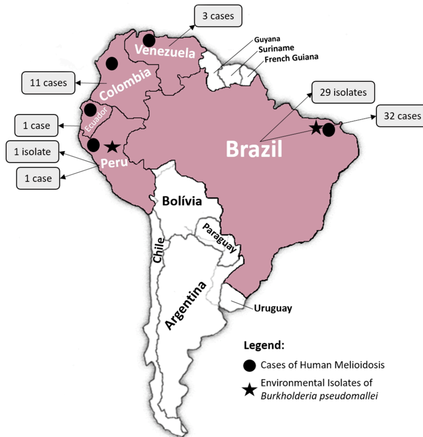
Figure 1. Melioidosis in South America.

in four countries by the 1990s: Venezuela, Colombia, Brazil and Peru (in order of first reporting) (Figure 1) [2,13,21]. A genetic study, which included isolates from Ecuador, Venezuela and Brazil, suggested that isolates of B. pseudomallei from Central and South America probably had an African origin and were most likely imported between 1650 and 1850, as a result of colonization and the slave trade [26].