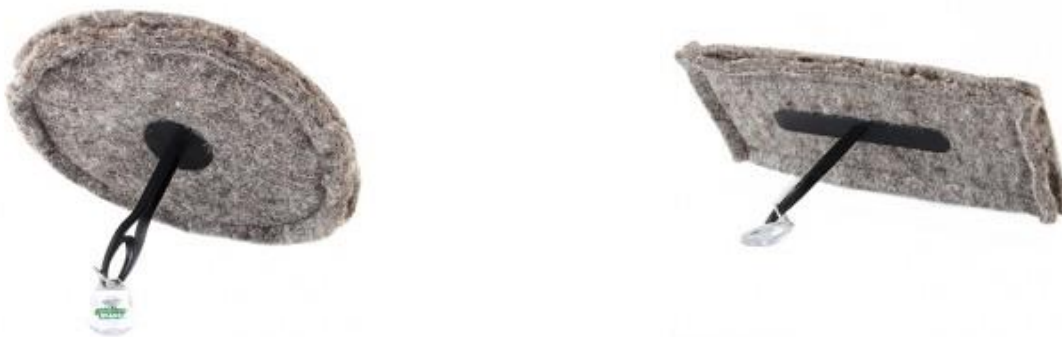
Figure 2. Chimney Sheep[7]

This report gives the results of the potential energy, CO 2 and cost savings in dwellings with chimneys resulting from the use of the Chimney Sheep, a draught excluder for chimneys. The Chimney Sheep is designed and manufactured by ‘Chimney Sheep Ltd’ to prevent the heat loss from chimneys. This is achieved by fitting the wool head of the Chimney Sheep into the narrow part of the flue. The Sheep comes in five sizes which fit the vast majority of chimney flues. Figure 2 shows different shapes of Chimney Sheep: