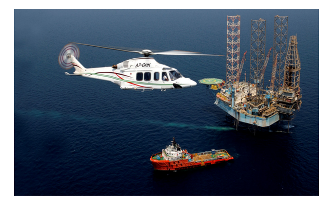
Figure 1: Offshore operation for rotorcraft.

A similar regulation associated to a specific operation in order to quantify the risk and bring it to an acceptable level could be developed for rotorcraft too. In this case the proposal of Leonardo<sup>7</sup> is to tackle one of the most hostile environment for ro-