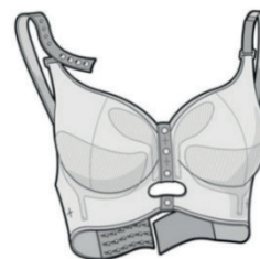
Figure 1 Diagrammatic presentation of the S4A bra.

A support bra (S4A bra) has been designed for women who have undergone wide local excision of a breast tumour and require a course of adjuvant radiotherapy. The bra is designed to lift and hold the breast away from the chest wall aiding treatment planning, and delivery while improving patient dignity. The primary endpoint was a support bra that is technically acceptable to health-care professionals (HCPs) and aesthetically acceptable to patients.