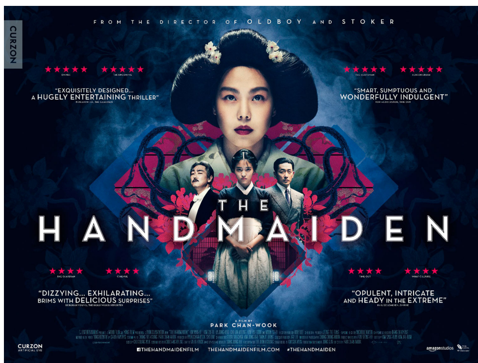
Figure 1. UK poster of The Handmaiden (Curzon Artificial Eye).

performing Korean film by a wide margin, beating Park's own Oldboy at £316,000 (Gant 2017, 9). As Charles Gant points out in his Sight & Sound report, 'that's a remarkable result', considering the relatively poor box office track record of Korean films as well as the fact that foreign language films rarely hit £1 million in the UK market. 2 Then again, as Gant puts it, ' The Handmaiden offered an altogether different proposition for UK audiences', and one of the salient aspects for its UK distributor Curzon Artificial Eye was the film's 'connection to Sarah Waters's novel Fingersmith ' (2017, 9). Indeed, for all intents and purposes, The Handmaiden is an adaptation of British writer Waters's third novel Fingersmith , even though the film transports a gothic tale of crime set in nineteenth century England to Korea of the 1930s when the Korean peninsula was under Japanese occupation. Furthermore, notwithstanding the cultural relocation, The Handmaiden is in steadfast and evident dialogue with Fingersmith , and it is this intermedial relationship between the original novel and the film adaptation that is the main concern of this article. In particular, it focuses on the sensual eroticism of the central lesbian couples in both texts.