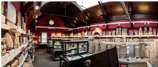
Fig. 1. The inside of the museum at Chesters Roman Fort and Museum.

The work presented in this paper revolves around The Clayton Museum, a small archaeological museum that is part of an English Heritage property, Chesters Roman Fort and The Clayton Museum, which includes the remains of a fort and bathhouse. The Roman fort at Chesters is part of Hadrian's Wall, the fortification built by the imperial army across the North of England in c. 122 AD that it is today a UNESCO World Heritage Site. The museum at Chesters was created in 1896 to host John Clayton's collection of Roman objects, mostly from Hadrian's Wall and its surroundings. John Clayton is credited with the preservation of Hadrian's Wall: his country home had the fort of Chesters in the grounds and he began excavating there in 1843. The museum, first opened in 1896 (Fig. 1), retains the late 19th-century style of display used in museums in Victorian and Edwardian times for the pleasure of its owner and the first travelling visitors.