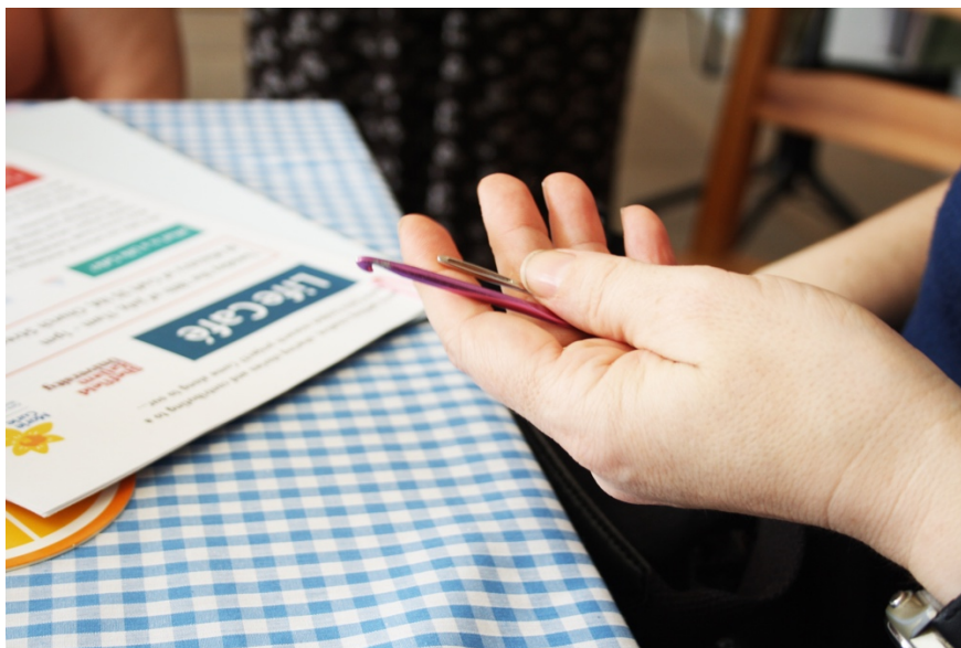
Figure 3: Objects of importance

Death is a taboo subject, and attendees at the Life Cafés spoke of the need for more education and awareness. The objects and activities contained within the Life Café had immediate resonances with participants and prompted very personal discussions, unique to the individual. The value of objects and materials in promoting and supporting positive memories was seen as important and this was reinforced in the methodology adopted through the Life Café. Objects spark conversations, stories and hold memories. People talked about things that they had kept, not because of the monetary value, but because they held important memories - often memories of people and relationships.