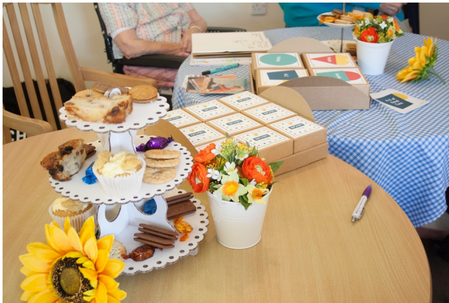
Figure 1: Life Café set up

The consent process included permissions to video record/tape the workshop and these recordings were transcribed and analysed using thematic analysis. In order to triangulate the data, the themes were embodied in a series of images and objects that were shared with other groups and stakeholders to check the findings against the views of experts and researchers within palliative care. Where particular objects and images were found to be especially helpful in eliciting conversations these were fed back into the Life Café methodology. As a consequence the Life Café was effectively designed in partnership with participants over the duration of the study.