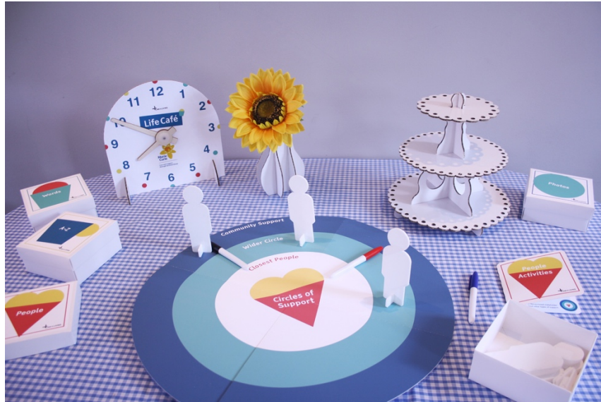
Figure 4: Life Café Kit