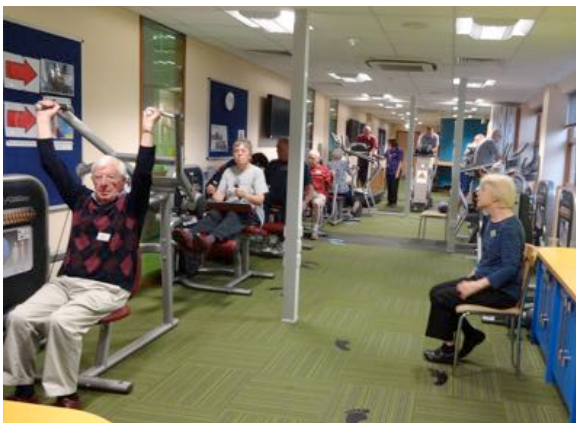
Figure 3. Circuit class