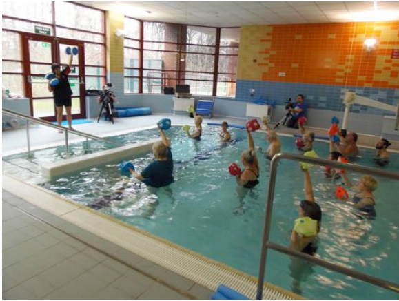
Figure 5 Aquarobics