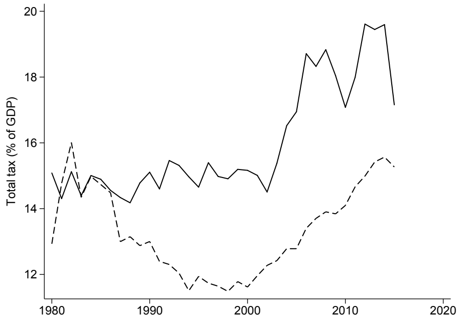
Figure 2: Average tax revenue

Notes: Figure 2 shows the evolution of the averaged tax-to-GDP-ratio for countries which adopted a SARA and countries that did not, respectively the full line and the dotted line.