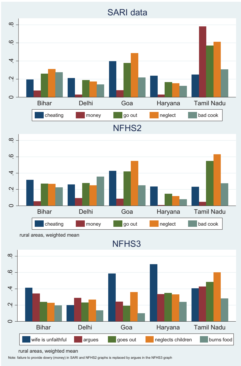
Figure 1. Tolerance of spousal beatings, by state and cause.

However, as noted above, it turned out that, because of a recent ‘ tragic case involving an alleged dowry murder in Tamil Nadu ’ which was receiving much attention in the press, the question actually asked in the SARI survey was ‘ whether it was acceptable for a husband to beat his wife if she took money that was meant to be used for other things in the household and misused it or used it for herself. ’ 23 This question means something very different and is ‘leading’ in a manner that the original question was not. This makes it harder to assess external validity and casts doubt on the variable’s value in construction of the tolerance of violence index.