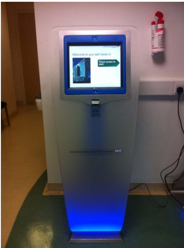
Figure 1 Self-service check-in kiosk.

relation to patients managing their own long-term conditions, for example, diabetes, and anti-coagulant medication: