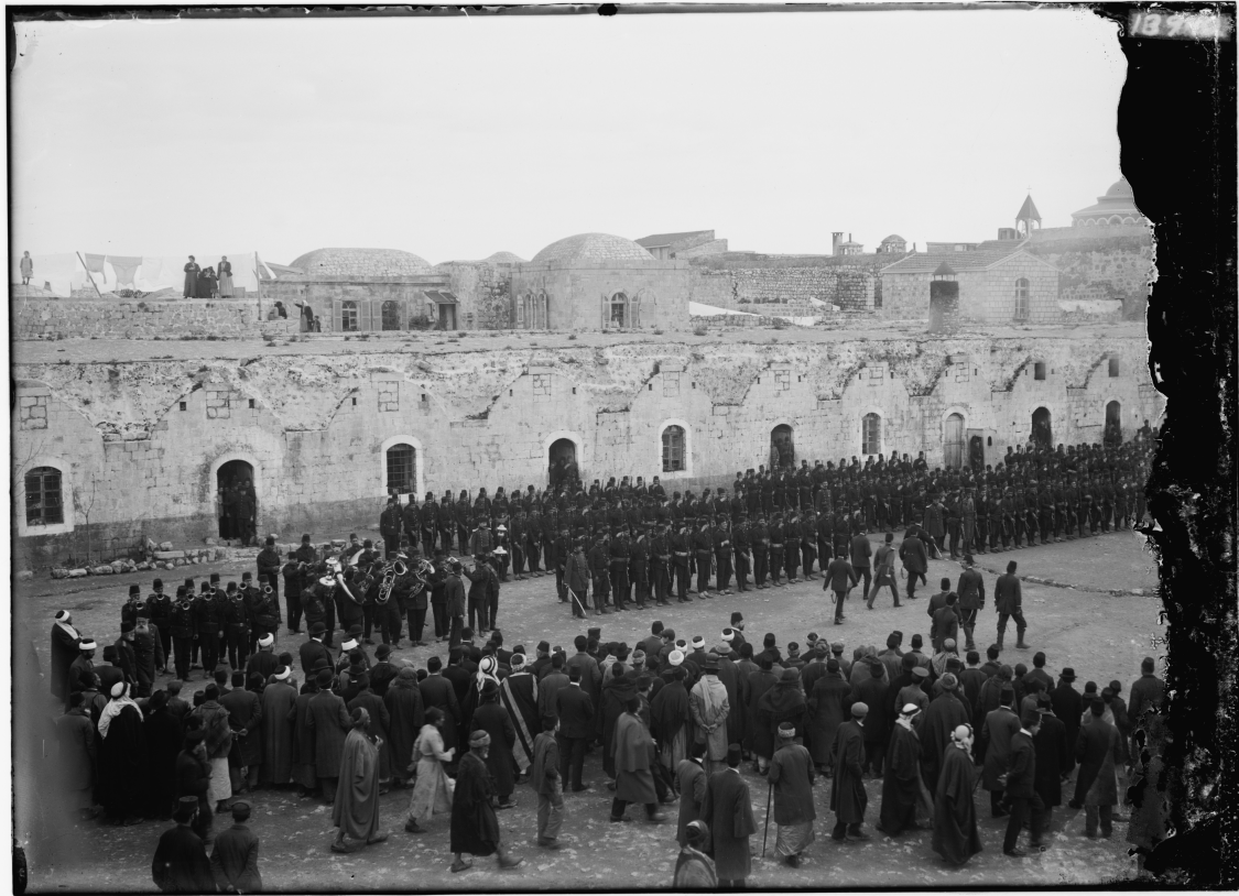
Image 5: 'Turk [i.e. Turkish] troops & band on parade ground', 5x7 in. photograph by American Colony (Jerusalem) Photo Department, between 1898 and 1917. Source: Library of Congress, Prints and Photographs Division, Matson Photograph Collection, reproduction no. LC-DIG-matpc-04782.

One photograph in the Library of Congress collection allows us a view of just such an occasion (image 3). Part of a group of images by the photography department of the American Colony in Jerusalem, it is not clear who the photographer was for this particular photograph. The American Colony produced many photographs, prints, albums, and other visual materials to sell in their shop just next to the Jaffa Gate, and a number of Ottoman subjects, including Palestinians, Lebanese, and immigrant Jews, as well as foreigners, notably the Swede Lewis Larson. 24 A unit of Ottoman soldiers can be seen greeting military and civil dignitaries in the kışla , the barracks situated near to the Jaffa Gate. Although a crowd is gathered inside the barracks, it is formed exclusively of men, most of whom have their backs to the camera, although there is a small group of women and children watching from the rooftops. As the soldiers present arms in the European manner whilst making their reverences by touching their right