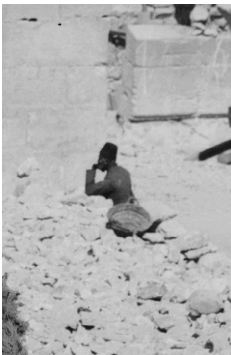
Image 13: Detail from ‘Mili [i.e., military] band in street parade beside Ger. [i.e, German] Church of Redeemer, 1898 Emp[eror] visit’ (image 11)

between the depiction of the German band with that of the Ottomans is quite striking, whether it was intentional or not to stimulate such a comparison. Here, the Ottomans were literally pushed into the sidelines, barely visible in the zoomed out view of the photograph, a mere ornament to the triumphal parade of the Germans and their kaiser, overshadowed by the dedication of a new gleaming Lutheran church to dominate Jerusalem’s skyline, and the professionalism of the senior partner in an evolving military alliance, represented by its military band. Meanwhile, on top of a building site next to the new church, an Ottoman worker