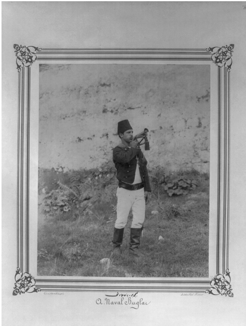
Image 1: 'The Sailor Bugler Sergeant / A Naval Bulgar', photographic print, albumen, by Abdullah Frères, Constantinople, between 1880 and 1893.

This divide in perspective has been explored in a wonderful paper by Julia Adeney Thomas, who defines the two positions as one of 'recognition' and the other of 'excavation'. 5 As this paper will investigate photographs of musicians, the best way to develop this point is with a photograph of one, specifically a bugler from the Ottoman navy (image 1). Looking at this photograph we can immediately identify this young man as a musician, and perhaps discern from his clothes that he is employed in the military. We might