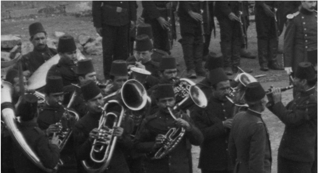
Image 7: Detail from 'Turk [i.e. Turkish] troops & band on parade ground' (image 5)

doorway of the barracks just behind the band, a group of soldiers look out, one starting at the musicians decidedly unimpressed, some others having a chuckle, seemingly at their expense.