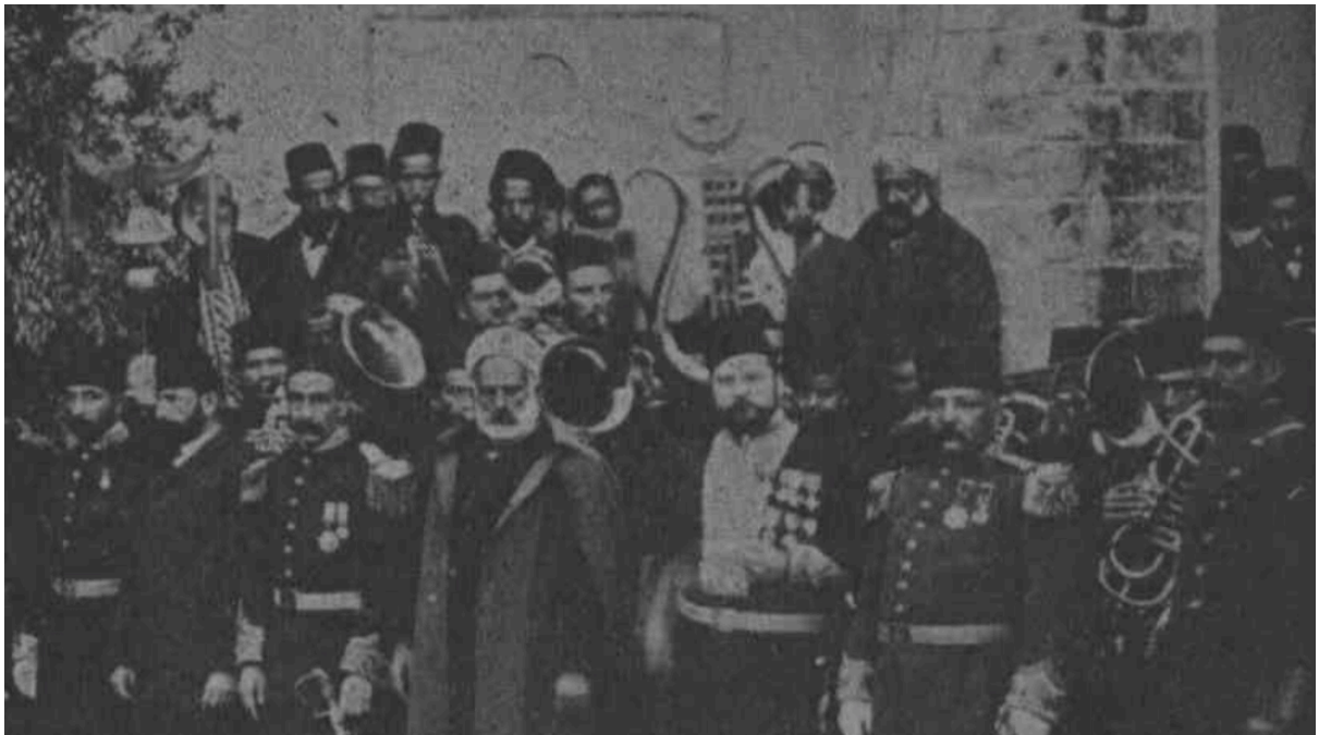
Image 15: Detail from ‘The official inauguration of the water supply [...]’ (image 14)

The picture painted here is the standard picture of Hamidian ceremonial, in which the military and its band played a central role. This is something emphasized in the official photographs of the occasion, printed in Servet-i Fünun , which depicts two scenes. The first shows the actual ceremony of the dedication of the fountain, with religious officials, civil and military officers, soldiers, and a smattering of the general populace. Several individuals raise their hands in prayer, and many look towards the camera in this posed scene, and some members of the band are visible to the left of the photograph. The second scene (image 14) is a formal portrait of some of the religious, civic, and military dignitaries outside the Haram al-Sharif, and also includes the military band on the right. Many of the visible band