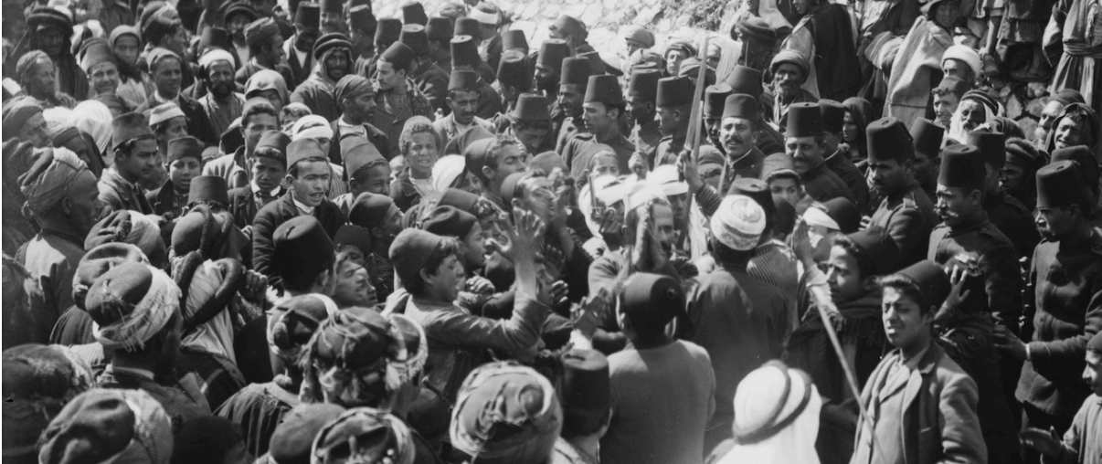
Image 18: Detail from ‘Costumes, characters, etc. Dancing dervishes in procession [Nebi Musa procession]’, 5x7 inch stereograph by the American Colony (Jerusalem) Photo Department, between 1900 and 1920. Source: Library of Congress, Prints and Photographs Division, Matson Photograph Collection, reproduction no. LC-DIG-matpc-01219.

fez brandishing a sword. In a crowd reflecting a similar class, age, and ethnic diversity to Rau’s stereograph, some clap, some sing, and many of those watching do so with grins on their faces. Here, it is the military who are the observers, and even though some of them watch on with approving smiles many of their faces are intently fixed upon the crowd. Just like in the photograph of the procession of the German naval band, here the Ottoman state is sidelined. This is the state looking in upon the festivities of the people, rather than the people co-opted into the celebrations of the state.