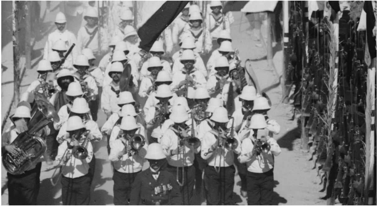
Image 12: Detail from ‘Mili [i.e., military] band in street parade beside Ger. [i.e, German] Church of Redeemer, 1898 Emp[eror] visit’ (image 11)