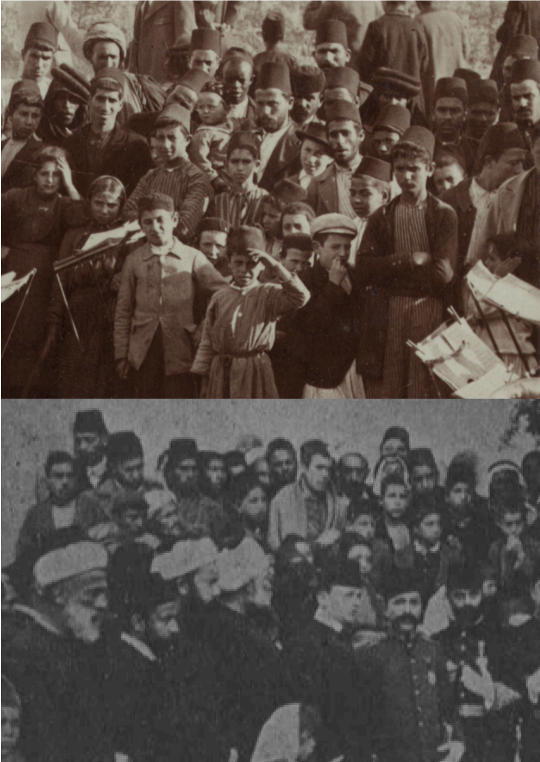
Image 19: Top: Detail from Rau, ‘Moslem band’ (image 16); Bottom: Detail from Servet-i Fünun , ‘Official inauguration’ (image 14).

into the human “types” that Shaw described, a component of the scenery on the canvas of loyal Ottomanism.