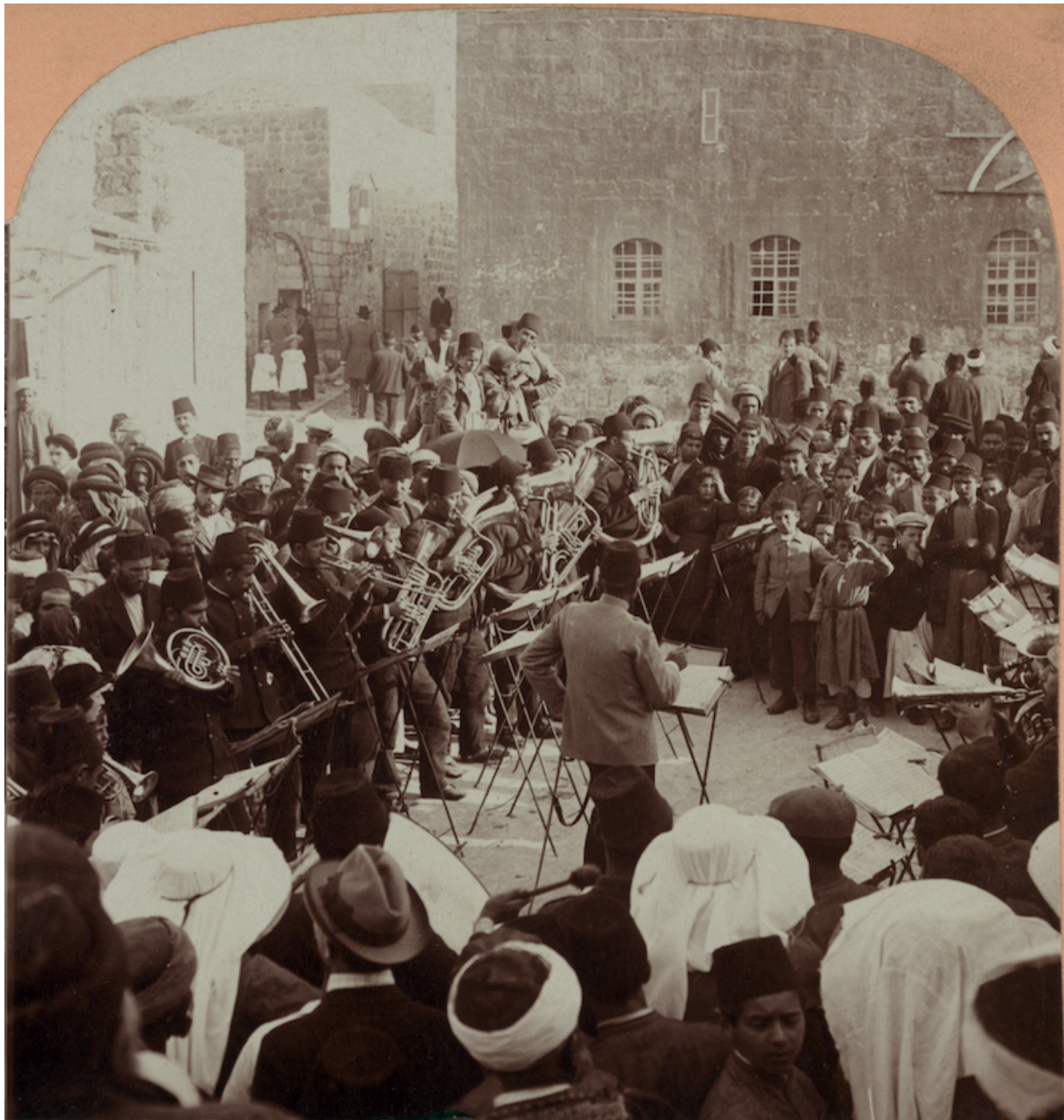
Image 17: Detail of the right photograph of ‘Moslem band’ (image 16).

walls of the barracks. Yet the image makes our eyes focus on the people and objects nearest to us, and the composition of this image draws the eye to the band conductor in the centre. 44