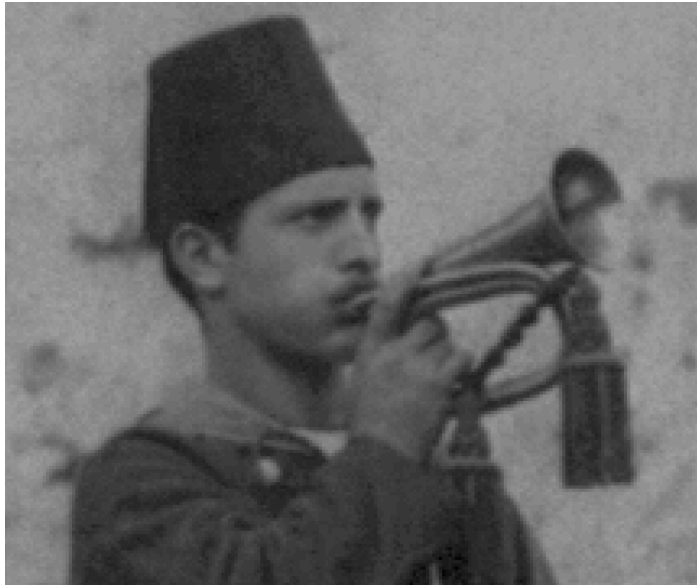
Image 2: Detail from “The Sailor Bugler Sergeant / A Naval Bulgar” (image 1)

Zooming in on these images, studying the facial expressions of each individual, separately and as a group, begins to reveal new potential areas of enquiry, thinking about the photographs as more than likenesses of historical individuals. Looking at a close up of the bugler's face, we can begin to sense the power relations at the heart of these and so many other photographs. 8 His furrowed brow, intense stare, air-filled cheeks, tell quite a different story. How long has he been posing for this photograph?