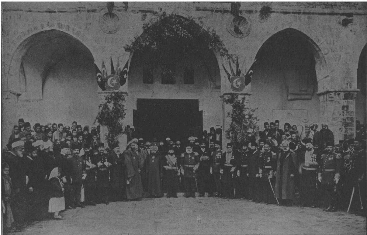
Image 14: 'The official inauguration of the water supply developed under the patronage of His Majesty the Caliph at the waters of the Süleymaniye springs within the Noble Sanctuary in Noble Jerusalem held on the auspicious day of the imperial birthday of His Majesty the Padishah . Source: Servet-i Fünun , 13 Kanun-u Evvel 1317 (26 December 1901).