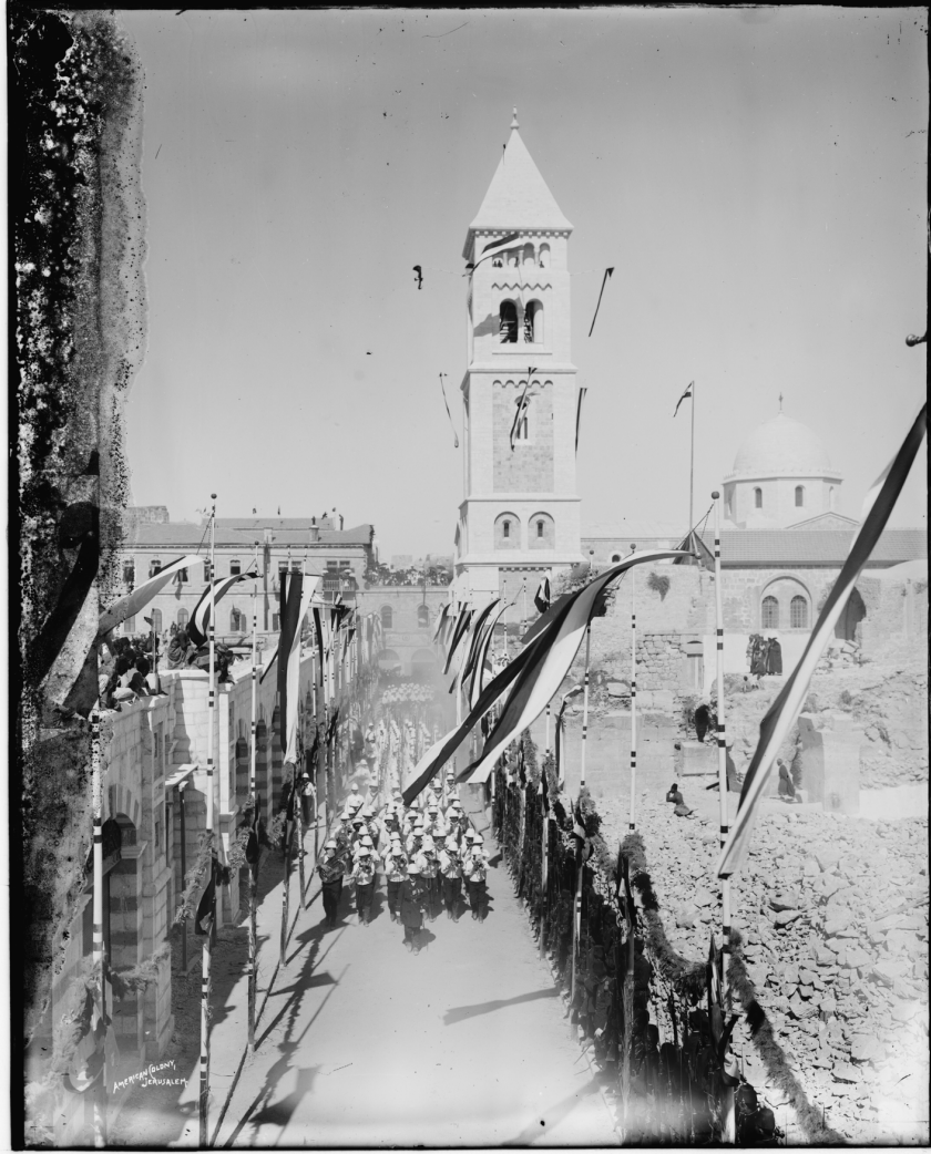
Image 11: ‘Mili [i.e., military] band in street parade beside Ger. [i.e, German] Church of Redeemer, 1898 Emp[eror] visit’, 10x12 inch photograph by the American Colony (Jerusalem) Photo Department, 1898. Source: Library of Congress, Prints and Photographs Division, Matson Photograph Collection, reproduction no. LC-DIG-matpc-07168.

However, the Ottoman band was overshadowed by that of the visitors. İsmail Zühdi described in detail the arches and flags erected along the parade route from the Jaffa Gate to the Erlöserkirche: “After the conclusion of the various speeches, His Majesty the said Emperor, with a special salute by