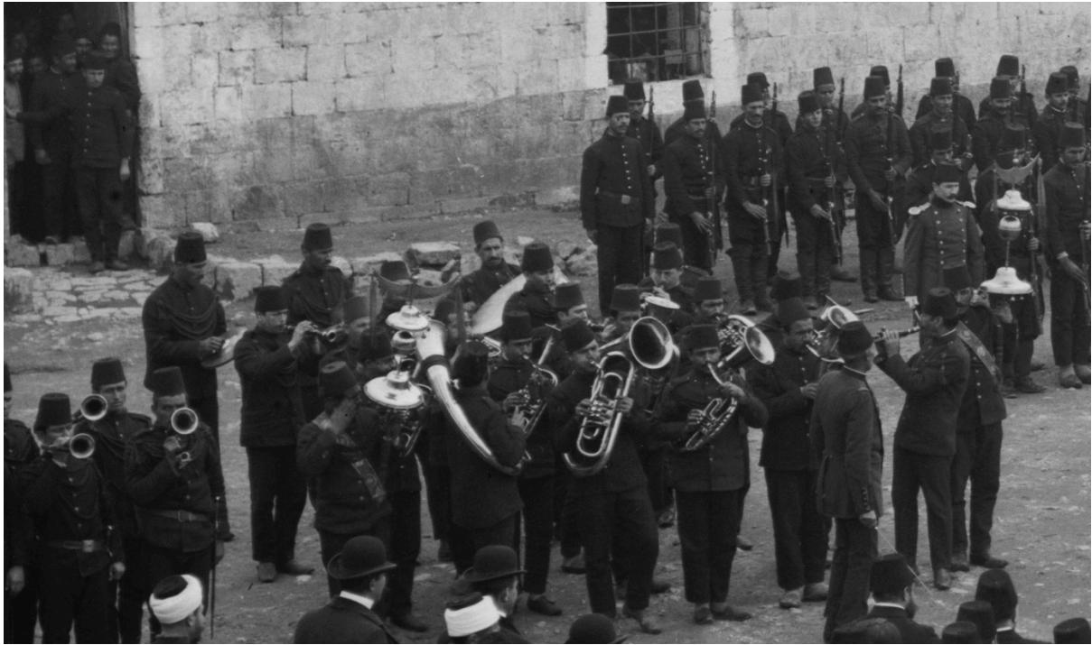
Image 6: Detail from 'Turk [i.e. Turkish] troops & band on parade ground' (image 5)

hand to their foreheads in the Ottoman style (quite a feat!), they are accompanied by the music of the band, formed of twenty-three musicians and their conductor. They provide a sharp contrast with the soldiers to their left and the buglers to their right. The conductor is looking at the dignitaries walking past, and few of the musicians are watching his conducting. The clarinetist in the front rank has turned to look at something going on behind him, attracting a comment from the musician next to him playing the çevgen (known in the West as a Turkish Crescent, or Jangling Johnny). Whatever was happening towards the back has also caught the attention of two of the other musicians, as another clarinetist in the third rank on the right and the heliconist in the front rank on the left have turned to look. Following the gaze of those musicians, as well as the serious stares of the two cymbalists at the back, the blame seems to fall quite squarely on one of the other clarinetists in the third rank. Whether he was playing out of tune, out of time, too loud, or a bit of all three, we can never know, but something was clearly going on with his playing that was disrupting the performance. As further evidence of this, in the