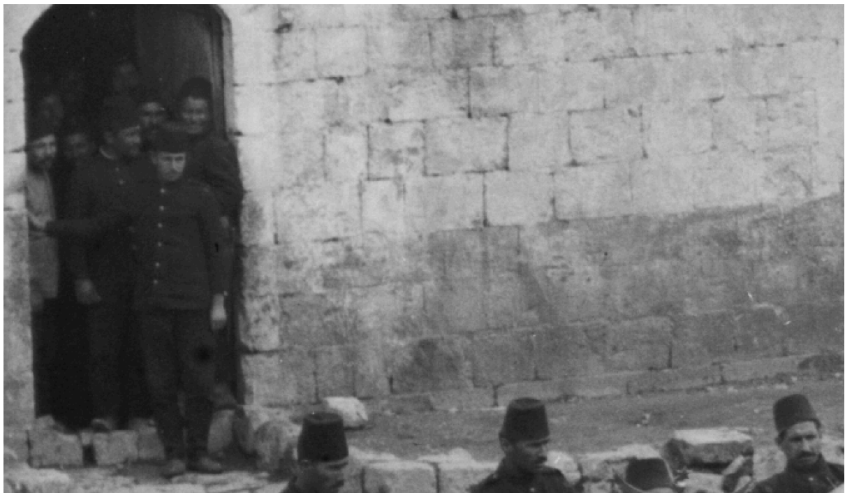
Image 8: Detail from 'Turk [i.e. Turkish] troops & band on parade ground' (image 5)