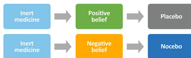
Fig. 1 Placebo versus nocebo [2, 3]

The NOR-SWITCH study, a 52-week, randomised, double-blind, non-inferiority, phase IV study, was conducted in adult patients with axial spondyloarthritis, rheumatoid arthritis (RA), psoriatic arthritis (PsA), Crohn’s disease, ulcerative colitis, or psoriasis. Patients with informed consent were randomised to either continue originator infliximab (IFX) or to transition to biosimilar infliximab (CT-P13) [21]. This trial demonstrated that switching from IFX to CT-P13 was non-inferior to continued treatment with IFX [21]. However, discordance in patient and physician outcome reporting was observed, which is a phenomenon previously reported [22]. Using patient-reported outcome (PRO) measures such as patient global assessment—one of the most widely reported PROs in RA—allows a more holistic assessment of disease and provides the patients’ perspective on aspects of their condition [23]. Figure 2 highlights disease experience also