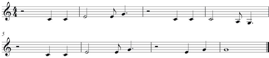
Example 1: “Work” theme from Symphony in Black , author’s transcription.

orchestra, and reenactments of, among other things, hard labor, a child’s funeral, and a nightclub dance. During the section of the film depicting hard labor, as workers are shown shoveling coal into a furnace, an echo of the opening work-song motif of Black, Brown, and Beige can be heard.