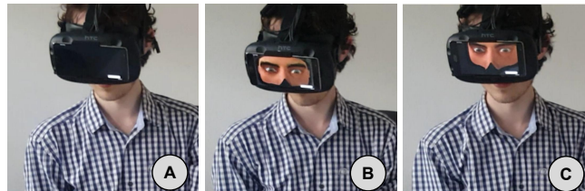
Figure 1: Our approach allows for bystanders to perceive the HMD user's face. (A) shows the situation as it is today. In (B), we show a 2D image of the user's face on a smartphone screen mounted on an HMD. While in (C), we show a 3D-face model that is projected according to the bystander's head position, which is detected using the front-facing camera of the smartphone (Perspective mismatch in (C) is created by the camera position and the tracked head position).

Permission to make digital or hard copies of part or all of this work for personal or classroom use is granted without fee provided that copies are not made or distributed for profit or commercial advantage and that copies bear this notice and the full citation on the first page. Copyrights for third-party components of this work must be honored. For all other uses, contact the owner/author(s).