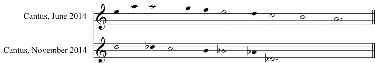
Figure 3.3 – Transformation of Cantus in Made of My Mother's Cravings

alternating long and short note values. Gottschalk describes the ensemble members' memories of the score as being "eroded or replaced". 71