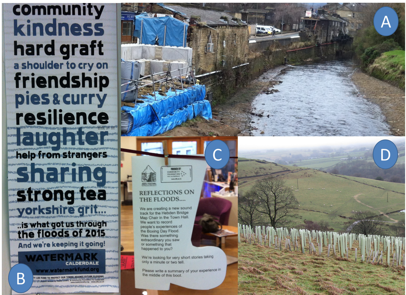
FIGURE 2 (a) The floods did considerable damage to the buildings and roads in Mytholmroyd. (b) Watermark poster with words describing the 2015 floods. (c) Reminder of the 2015 floods. (d) Tree-planting on a slope.

There was evidence of NGOs (e.g., Treeresponsibility) contributing to pro-action measures regarding changes to spatial planning. The NGO was involved in small-scale nature-based approaches, such as tree-planting, thereby contributing to flood