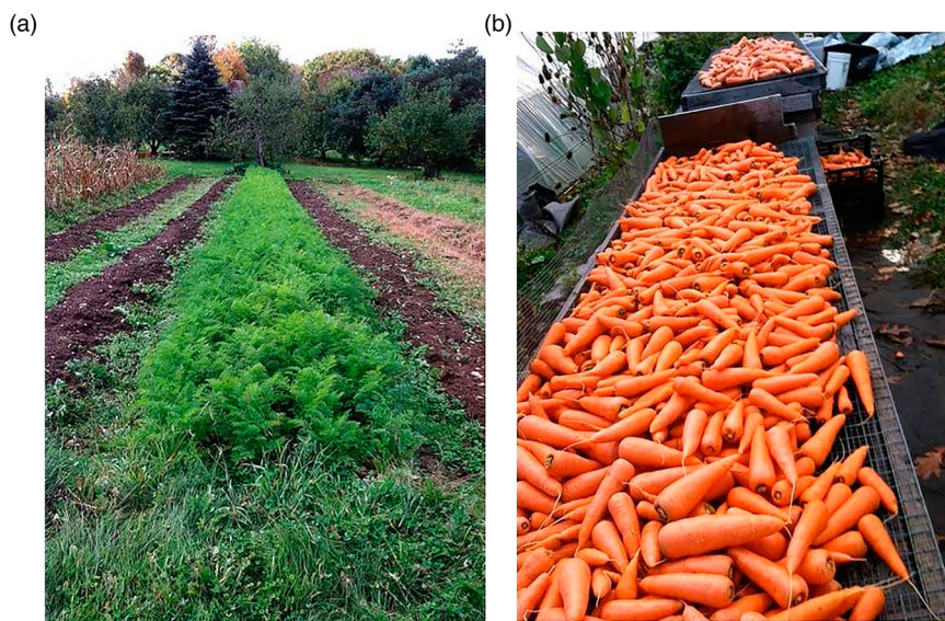
Figure 7. SCI carrot bed, on left, and harvest, on right, at Teltane Farm, Monroe, Maine, USA, 2014.

broadcasted square metre of land. This is a yield equivalent to 3 tonnes/ha.