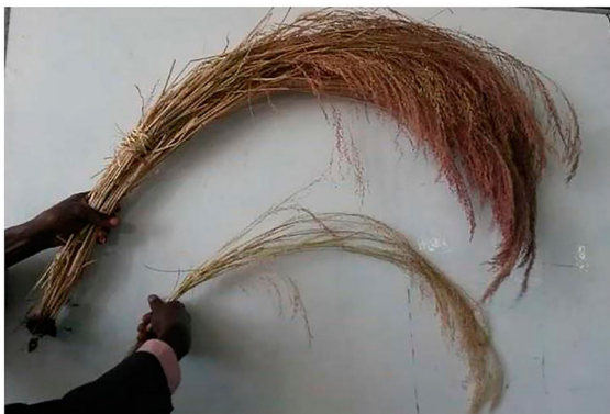
Figure 5. Comparison of tef panicles growing from a single plant: the top panicle was grown with TIRR methods, and the bottom panicle with standard broadcasting methods (photo courtesy of Z. Gebretsadik).

ATA reported that in 2014/2015, 2.2 million farmers were using TIRR methods, one-third of the total number of tef farmers in Ethiopia, on 1.1 million ha. The average TIRR yields of 2.8 tonnes/ha were 75% higher than produced with traditional methods,