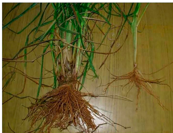
Figure 2. Comparison of the root systems of finger millet plants grown in Jharkhand state of India; SFMI methods on left, and conventional methods on right (photo courtesy of B. Abraham).

plants which are cultivated with SRI practices. These results were, however, unfortunately never published (Figure 3).