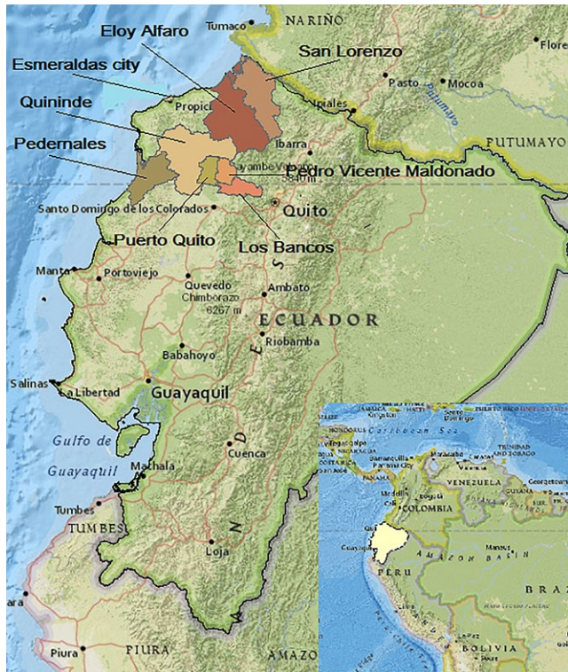
FIGURE 1 Map of Ecuador showing locations where studies of soil-transmitted helminth infections and allergy were done. Studies were done in tropical and sub-tropical regions of: Esmeraldas Province in the City of Esmeraldas, 30,53,54,77,78,81 the Districts of Quininde, 26,38,40,81 and Eloy Alfaro 27,30,34,41,53,55,77,78,81 and San Lorenzo 30,34,41,53,55,68,74,77,78 ; Pichincha Province in the Districts of Pedro Vicente Maldonado, Puerto Quito and San Miguel de los Bancos 26-29,61,62,66 ; and Manabi Province in the District of Pedernales 60

regions among populations living in poverty and inadequate sanitation. STH infections have been associated with significant disability and mortality, particularly in children. 10 The World Health Assembly (WHA) in 2001 endorsed a strategy for the control of these parasites through periodic treatments of schoolchildren with anthelmintic drugs. 11 In line with this resolution, WHO, national governments and donor organisations have prioritised the control of STH infections through periodic treatments with anthelmintic drugs to school-age children. Subsequently, recommendations for preventive chemotherapy have been expanded to include other high-risk groups, namely pre-school children and women of child-bearing age. 12,13