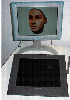
Fig. 1. Overview of the bathroom design application. The tablet is used for pen input to enter size and dimension of the bathroom.

through the application by explaining what it is expecting and by asking questions if the input is ambiguous. The user can simultaneously draw or write and speak.