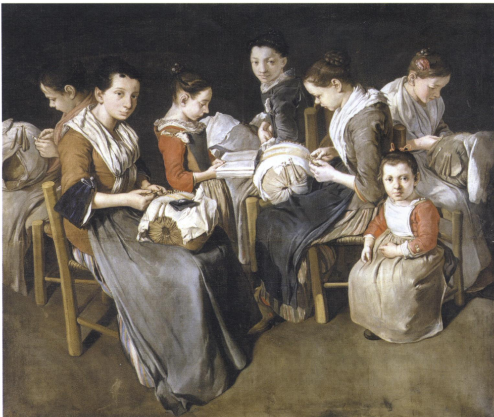
67. Women making lace ('The girls' school') , by Giacomo Ceruti. 1720s. 150 by 200 cm. (Private collection, Brescia; exh. Metropolitan Museum of Art, New York).

The fact that Longhi remains a crucial point of reference for many contributions to the catalogue, whether his arguments are accepted or rejected, illustrates the profound impact his views still have on the study of Lombard painting. In general, it is his philological, stylistic approach that has been taken over without much debate. Attempts to reveal something of the purpose and significance of Lombard naturalism are sometimes alluded to, but disappointingly almost never seriously discussed. What, for example, are the devotional implications of the brutal verism in the exposed body of Christ being crucified in paintings by Callisto Piazza (c.1535-38; S. Maria Inconronata, Lodi; p.169) or Vincenzo Campi (1577; Certosa, Pavia; p.208)? And how are we to interpret the obvious parallels with northern European art in Savoldo's Crucifixion (c.1515; Maison d'Art, Monte Carlo; p.148), with its Flemish-inspired landscape and borrowings from prints by Dürer and Cranach? A systematic approach to questions of this kind, which has been attempted in several monographic studies in the past few