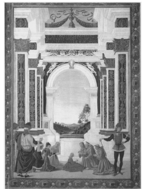
70. Miracle of the young girl , by Pietro Perugino. 1473. Tempera on panel, 78.5 by 56.5 cm. (Galleria Nazionale dell'Umbria, Perugia).

Was Vasari correct in supposing that Perugino was for a time in Verrocchio's workshop? The S. Bernardino panels do, to a limited extent, reveal Verrocchio's influence, especially in the angular structures of the draperies, but the impact of Pollaiuolo's ideas is far more prominent. The panels take up the narrative methods employed in the embroideries for the Baptistery vestments ( Il Paramento di S. Giovanni ) designed by Pollaiuolo from about 1466: using figures seen from the back to frame a space within which the scene takes place; giving figures rather large hands whose open-fingered gestures elaborate their emotional response to the events; the wearing of exotic head gear. The decorative vocabulary, such as the jewels that define the borders of all the S. Bernardino panels, relates to that seen in the Pollaiuolos' St James altarpiece for