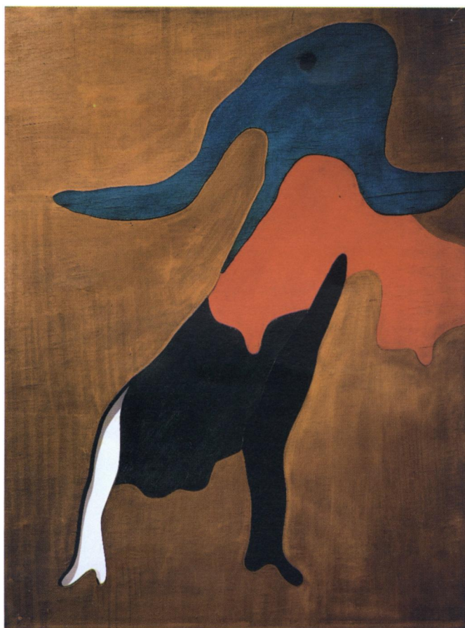
65. Tanzerin , by Hans Arp. 1925. Painted wood, 146.5 by 109 cm. (Centre Georges Pompidou, Paris; exh. Kunstmuseum Basel).

in Schwitters's work are or could be navels? As with other such elements in his collages, the significance of such inclusions is richly indeterminable, and references to Arp in Schwitters's œuvre seem to operate less as overt indicators of influence than as signs of friendship or sly artistic commentary. This appears to be the case even in Schwitters's late sculptures, several of which closely echo works by Arp but replace their graceful ease with an almost parodic awkwardness.