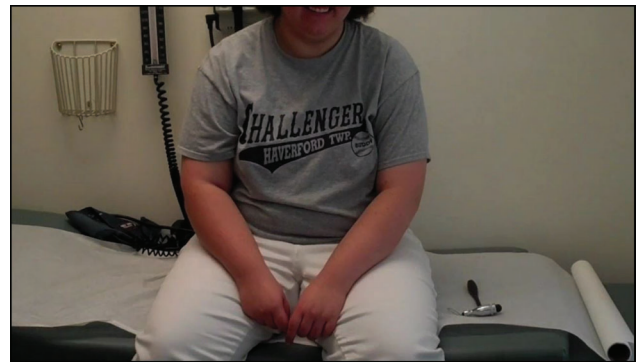
Video 1. Video of Neurological Exam. Mild cervical dystonia with left turn. Myoclonus affecting the neck and trunk. Myoclonus is elicited by auditory and tactile stimuli and worsened in the trunk and arms with posture and intention. The gait is slightly wide based and appears hypotonic. Handwriting induces worsening of cervical dystonia and neck and truncal myoclonus. Myoclonus affects handwriting and water pouring.

c.825+1_825+2delGT (NM_003919.2). This test was performed using next-generation sequencing, and deletion/duplication analysis was performed on the same assay utilizing an in-house algorithm that determines the copy number at each target. The variants identified through next-generation sequencing were subsequently confirmed via appropriate methods, including, in this case, Sanger sequencing. This 2-base pair deletion at the consensus donor splice site is expected to disrupt RNA splicing and likely results in an absent or disrupted protein product with an 'Human Splicing Finder (HSF) score of 3.0 and Combined Annotation Dependent Depletion (CADD) prediction score of 27.6. 25,26 This variant is absent from population databases