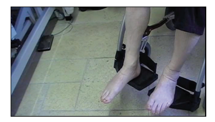
Video 1. Patient 1: Abduction and adduction of the toes on the right side, involuntary dorsiflexion and flexion of the right ankle and myoclonus.