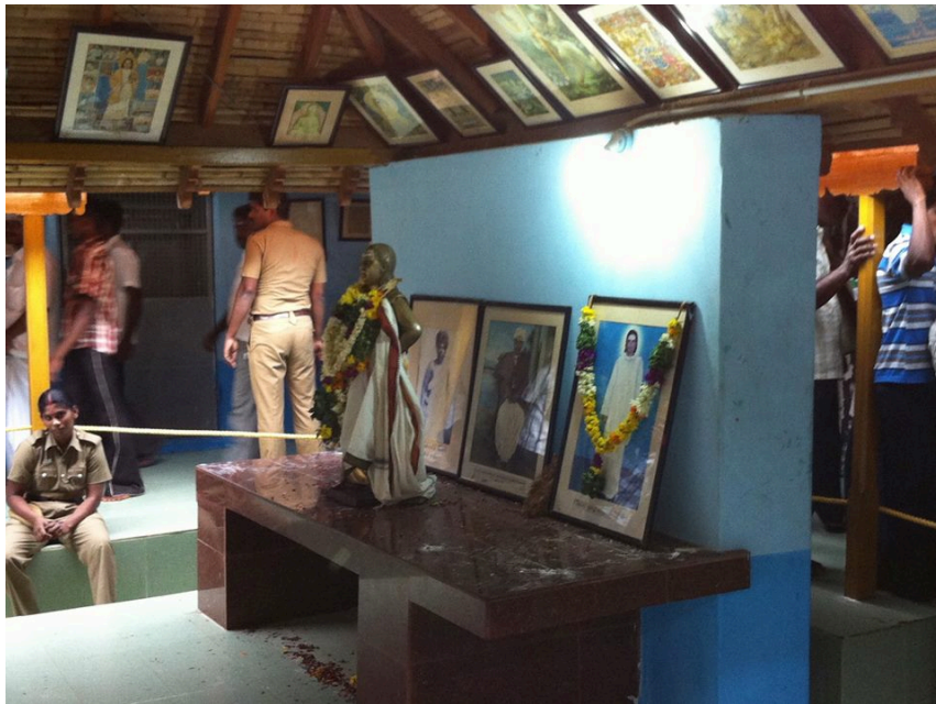
Figure Twenty-Seven: Muthuramalingam Memorial at Pasumpon

appeared in temples, dressed in the robes of a religious mendicant, on stages flanked by Chandrabose, and in an office with a pen in his hand poised above a piece of paper on his desk. He looked back at the viewers until they were ushered along by the police who shouted coarsely to prevent overcrowding.