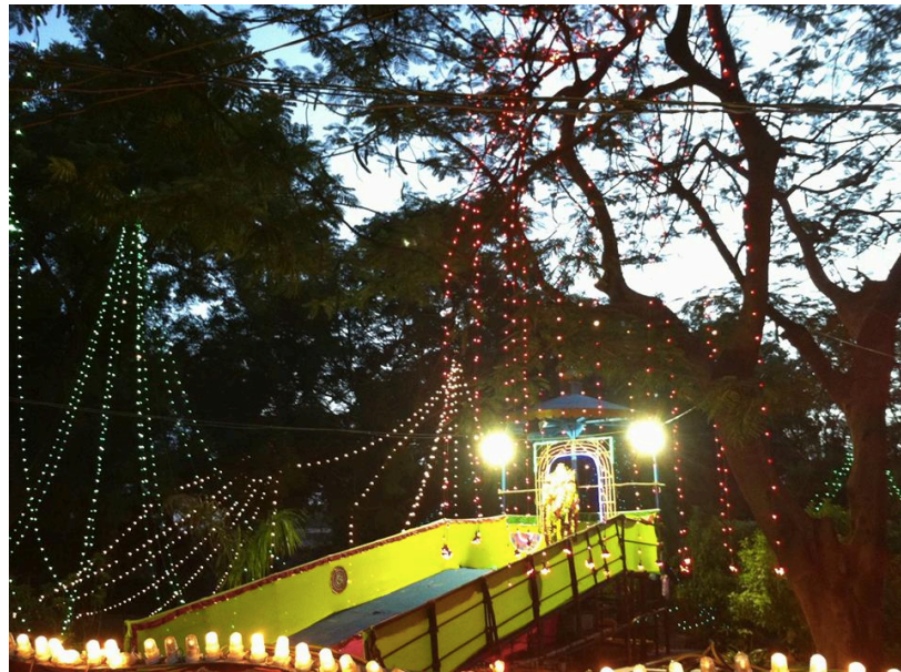
Figure Eighteen: Decorated Statue of Raja Raja Chola in Thanjavur in 2012

It was after six o'clock when the Pandian family arrived in their red and gold carriage, which harkened back to the triumphant days of the Chola kingdom (Figure Nineteen, Figure Twenty). Pulled by two bright white horses that wore ornamented bridles and decorative