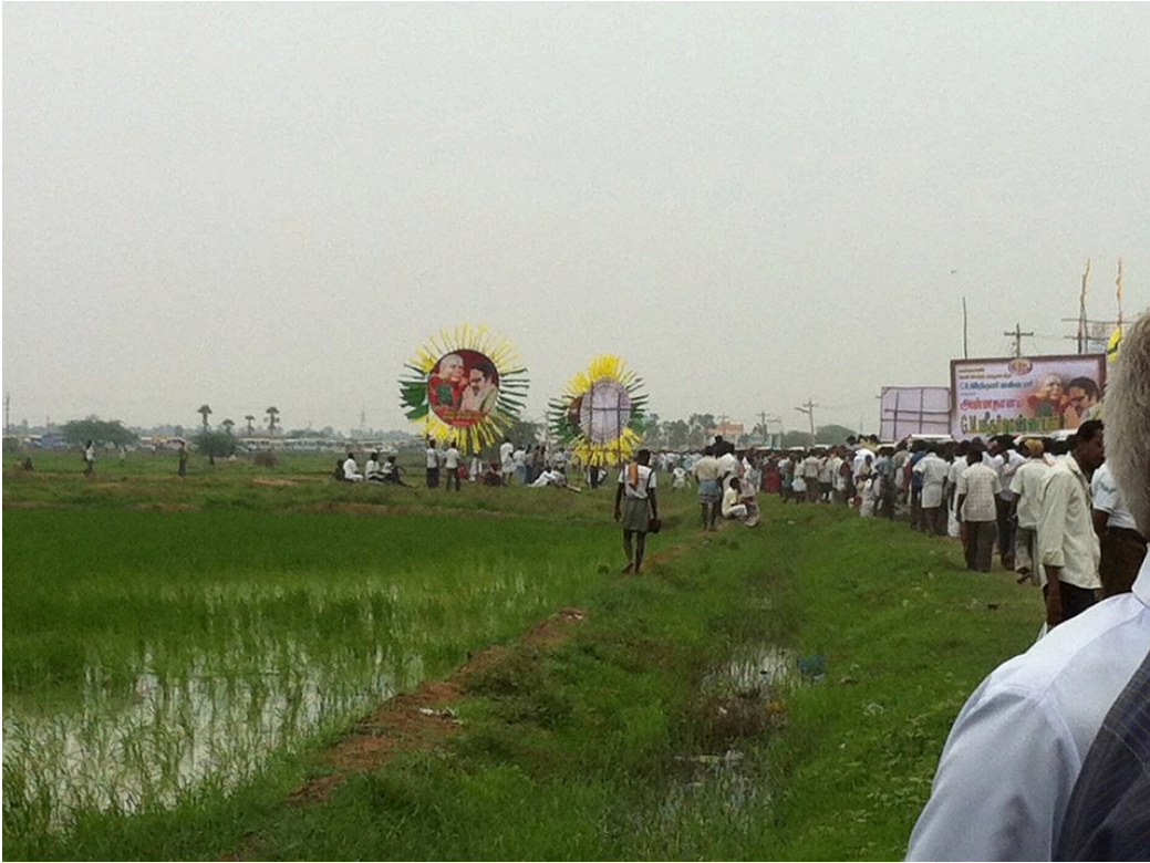
Figure Twenty-Five: Flexboards Demonstrating Vaiko’s Efforts at Thevar Jayanthi, 2012