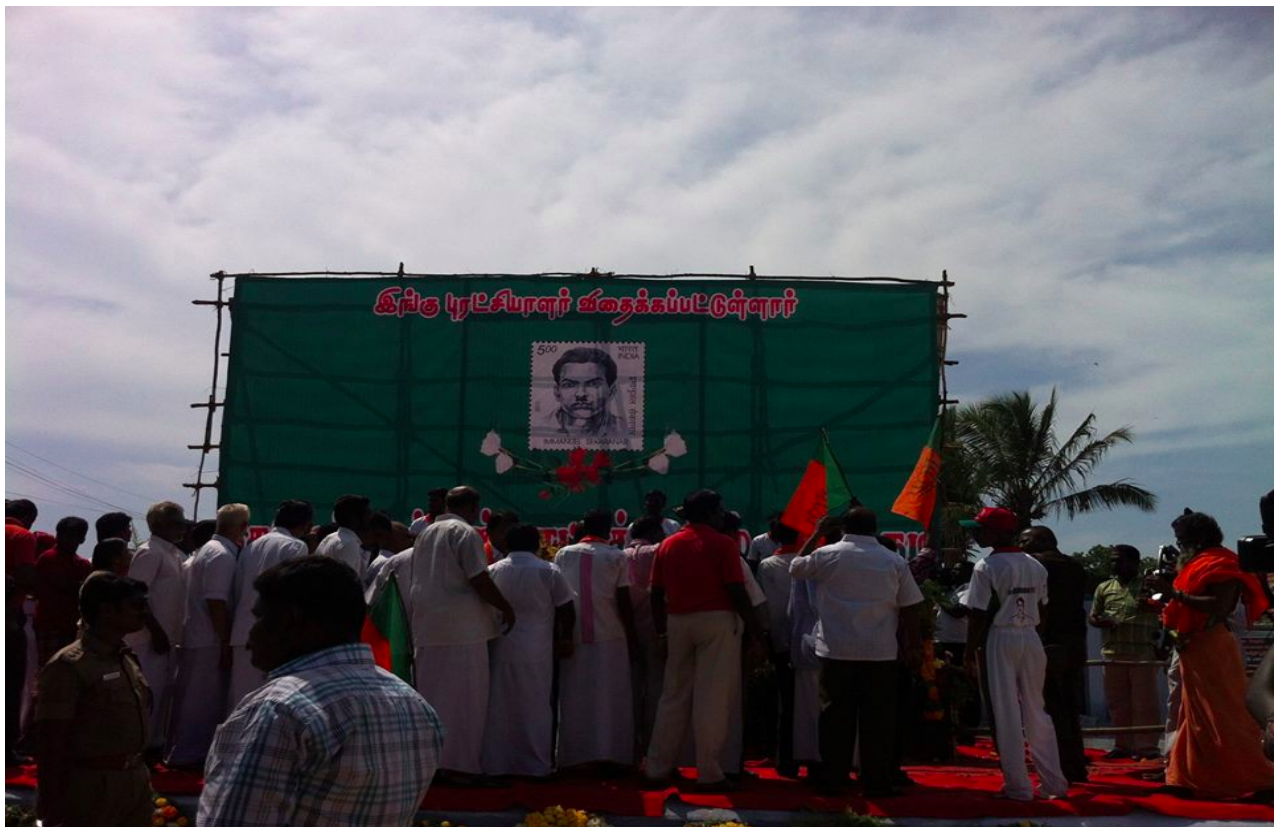
Figure Eight: Samadhi at the 2012 Ninaivu Vil

The Devendras' symbolic references to the government in order to legitimate their status claims were not limited to government staff. In fact, the Devendra Kula Vellalar Panpaatu Kazhagam displayed evidence of the government's recognition and approval by selecting a depiction of Immanuel's face on a postage stamp to grace the grand flexboard that served as the backdrop of the Samadhi (Figure Eight). Because paying respects at the Samadhi was the culmination of the pilgrimage for devotees and politicians, the picture of the stamp featuring Immanuel's face was photographed more than any other image at the event, and was thus easily shared and preserved as evidence of the government's recognition, the official stamp of approval for Immanuel as a leader of national significance.