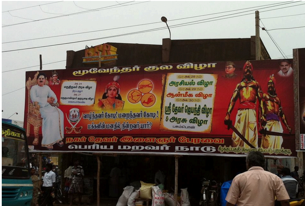
Figure Twenty-One: Flexboard in Paramakudi Featuring Muthuramalingam, the God Murugan, the Marudhu Pandiyar Brothers, and Subhas Chandrabose

Like the Niṇaivu Viḷā, the extraordinary nature of Thevar Jayanthi in 2012 was indexed and established by visual markers that began to appear a few days before the 30 th . Thevar images came to progressively populate Paramakudi, despite the fact that the town is thirty-seven kilometers away from Pasumpon. By the morning of the 30 th , the same Madurai-Rameswaram road that had been marked with Devendra images was occupied by flexboards featuring Muthuramalingam, often flanked by the Maradhu Pandian Brothers and Subhas Chandrabose, the national leader who I discuss below (Figure Twenty-One). The ground of Paramakudi thus became a contested terrain claimed by both opposing castes in the name of their heroes. The Thevars symbolically attacked the Devendras by eclipsing Immanuvel with Muthuramalingam and other heroes of their caste.