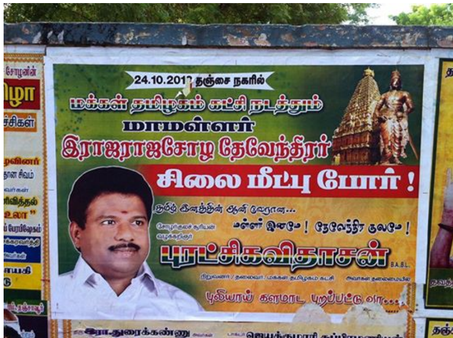
Figure Thirteen: Kavidasan's Poster at the Sataya Vilā of 2012