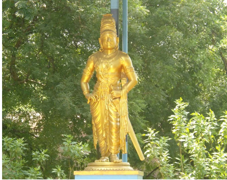
Figure Seventeen: Statue of Raja Raja Chola in Thanjavur