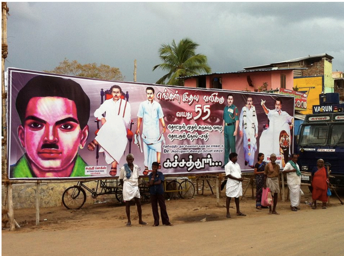
Figure Five: Immanuvel in Various Guises at the 2012 Nīṇaivu Viḷā

sarong. It is considered traditional formal wear for Tamil men. While the white Oxford-style shirt with which it is matched would not have been worn prior to the colonial period, it is now part of the uniform that bespeaks ideal Tamil masculinity, and that was worn almost exclusively by dominant caste communities until approximately the last thirty years. Respectably clad Immanuvel extends his hand and pointed index finger out towards the viewer, referring to the well-known story of his conflict with Muthuramalingam Thevar during which he refused to see the Thevar leader as worthy of respect superior to his own. Some larger flexboards feature Immanuvel in both forms, emphasizing his heroism. Regardless of his posture and clothing, Immanuvel's eyes are wide and his mouth is straight, refusing to reveal even a hint of a smile beneath his well-trimmed moustache.