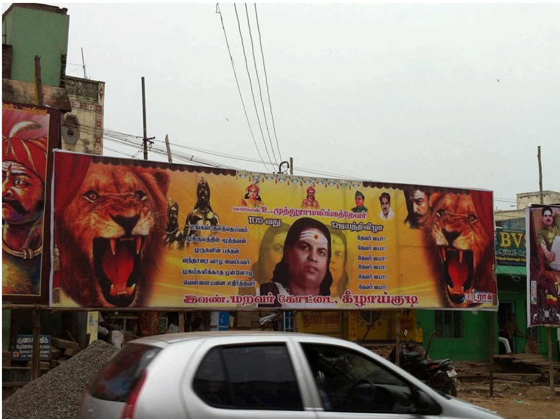
Figure Twenty-Two: Flexboard in Paramakudi Featuring a Number of Thevar Heroes and Subhas Chandrabose

the Jayanthi in 2012 (and in 2013), Muthuramalingam was conspicuously and repeatedly connected to Chandrabose who appeared, as he usually does, as a bespectacled bust clad in the uniform of the Indian National Army pensively gazing out into the distance. 195 He was always smaller than Muthuramalingam in scale, standing as a supporter in the background. Chandrabose also often appeared alongside a coterie of Thevar heroes, including the Maradhu Pandiar Brothers and Puli Thevar (the local rebel king discussed in Chapter Three), and was equal to them in size and often on their same plane (Figure Twenty-Two). He was thus subsumed within the Thevar caste, rendered a caste fellow, as well as an ally.