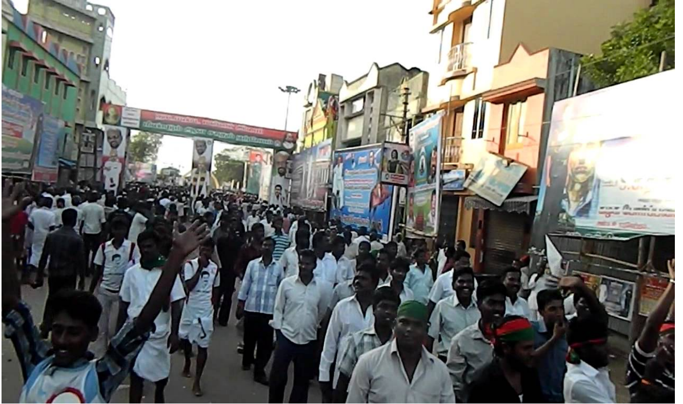
Figure Two: Some Flexboards and the Procession at the 2012 Tiyāki Immaṇuvēl Tēvētiraṅ Niṇaivu Viḷā

I continued to move beneath the arresting signs and through the heroic soundscape towards the Mahāl. There I found local Devendra leaders with whom I had already become acquainted, in addition to a group of Devendra leaders who had arrived from Chennai. The men from Chennai were not, in fact, Chennai natives but located their ūrs (“native place”, “village”) in Ramanathapuram District. 108 Nonetheless, their work and residence in the cosmopolitan city of Chennai distinguished them from the crowd. Not only did they have the largest watches and the shiniest shoes, but they were also offered the most comfortable chairs in the Mahāl, as well as a continuous flow of coffee and biscuits. The leaders of the Devendra Kula Vellalar Panpaatu