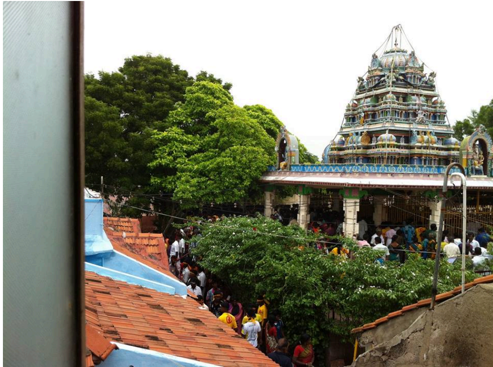
Figure Twenty-Eight: Muthuramalingam Temple at Thevar During Thevar Jayanthi, 2012