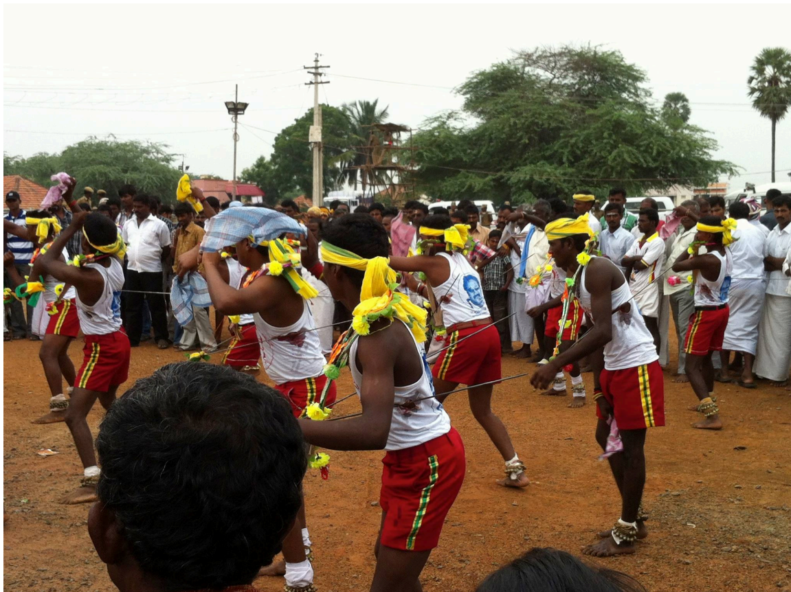
Figure Twenty-Six: Young Men Performing Tēvar Aṭṭam at Thevar Jayanthi, 2012

Performances of reverence at the memorial were ardent but less demanding. The memorial, built by the DMK government in 1971, looks like a small, humble village house topped by an old-fashioned clay tile roof and oriented around an open-air courtyard (Bose 1980,133). Subramanian and I entered, and joined a layered queue of devotees who were circumambulating the building's interior, stopping at the framed photos and graphic prints of Muthuramalingam that lined the walls (Figure Twenty-Seven). Their stops were brief, but earnest. Some of them hung small flower garlands on the frames, and others smeared the glass with sacred substances, such as ash and turmeric just as they would for images of deities or their deceased relatives. Whether or not they had come with offerings, Muthuramalingams' devotees pressed their hands together in prayer as they gazed at him in various guises. In the images, he