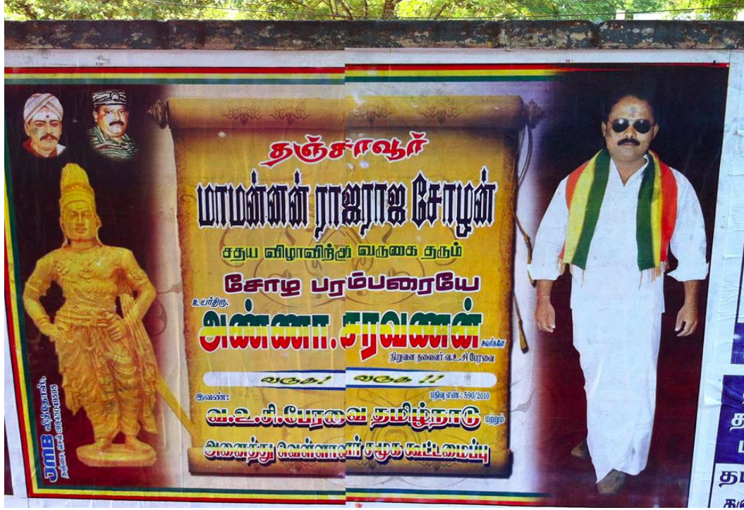
Figure Fourteen: V.O.C. Peravai’s Poster at the Sataya Viḷā of 2012

Next to the Vellalars poster, a long, horizontal yellow and red poster full of text and lacking anthropomorphic images, claimed Raja Raja Chola for the Vanniyar caste – another populous landowning community that was, unlike the Vellalars, designated as a Most Backwards Class after successful agitations in the 1980s. 181 The writing across the top of the banner read, vaṇṇiyar kula cūriyan! Terku āciyāvaiyē katti āṇṭu vāṇuyar periyakōyil tanta, pulikoṭi vēntaṇ vīra Vaṇṇiya Rāja Rāja Cōḷa..... , “Son of the Vanniyar lineage! The tiger flag king who in the era of building all of South Asia gave us the heavenly big temple, the heroic [vīra] Vanniyar Raja Raja Chola.