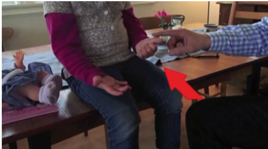
Video 1. Illustrative video of severe and mild mirror movements. Two patients (subjects #2 and #3) with severe mirror movements (severity score = 3), and then a patient (subject #7) with mild mirror movements (severity score = 1). The red arrow indicates the side of the voluntary movement.