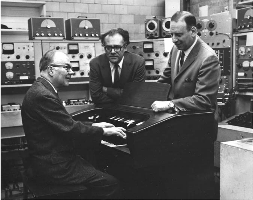
Fig. 4. From left to right: Otto Luening (playing an electronic organ), Vladimir Ussachevsky, and unidentified man

As the technology of electronic music advanced, the RCA was eclipsed by voltage-controlled modular synthesizers, such as models by Moog and by Buchla, which were more capable of real-time feedback, programming, and performance, and by digitally-synthesized computer music, which allowed much more specific control of parameters, although with the loss of real-time feedback, due to processing-power limitations of the computers of the time. Ultimately, the RCA synthesizer was a manifestation of a particular moment in the history of electronic music, but an important and influential one in moving that history forward.