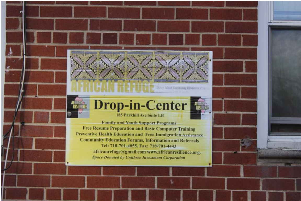
Figure 5. African Refuge maintains a Drop-in-Center on Park Hill Avenue and carries out programming in a number of different locations on the street.

“Hello” but not questioning your presence. Around the corner, suggested by the hand-painted but worn patterns of red, gold, green, and black, sits the office of African Refuge, a community organization working to meet some of the needs of Staten Island’s Liberian refugee community and the only such group to lend such support in the area.