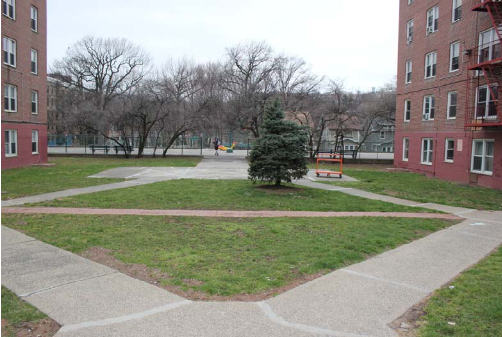
Figure 11. Public space on Park Hill Avenue.

kids skirt the poles on their bicycles. There is also one green lawn between 185 and 225 Park Hill Avenue: clipped grass with a diamond-shaped path skirting a messy pile of bushes.