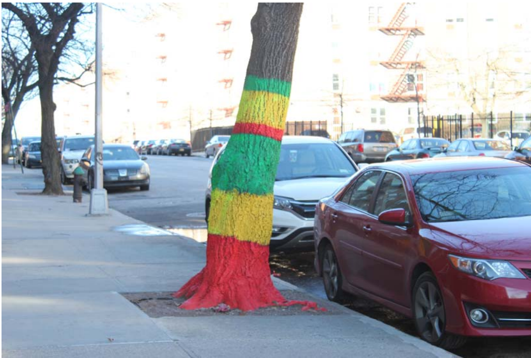
Figure 12. A bright spot: the pan-African colors decorate a street tree.

In a related question, I picked at the meaning of the word “home” by asking, quite rudimentarily, “Is this neighborhood ‘home’?” Asking people who had fled a different country and now lived, with little prospect of return, in this one, I entered into Park Hill expecting one of two answers: “Yes,” because that is where they live now and for the future; or “No,” because one’s first home is always their last home. The responses did not fit so neatly into my categories.