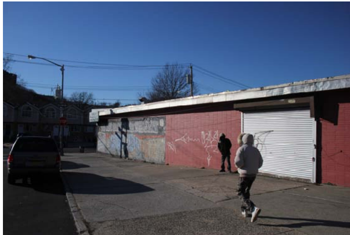
Figure 8. The boys of Park Hill and their stretch.