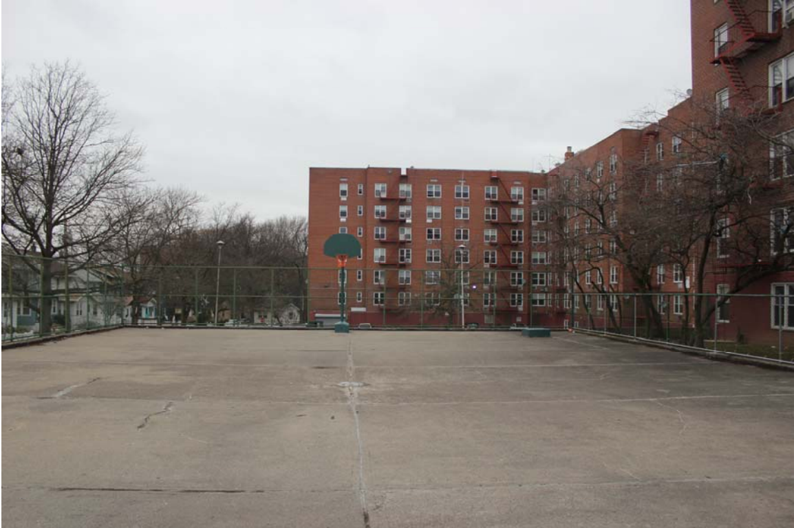
Figure 9. Housing and “open space” on Park Hill Avenue.

the neighborhood to rehabilitation or psychiatric therapy, yet newly sprung gang groups also provide a type of coping mechanism. 135