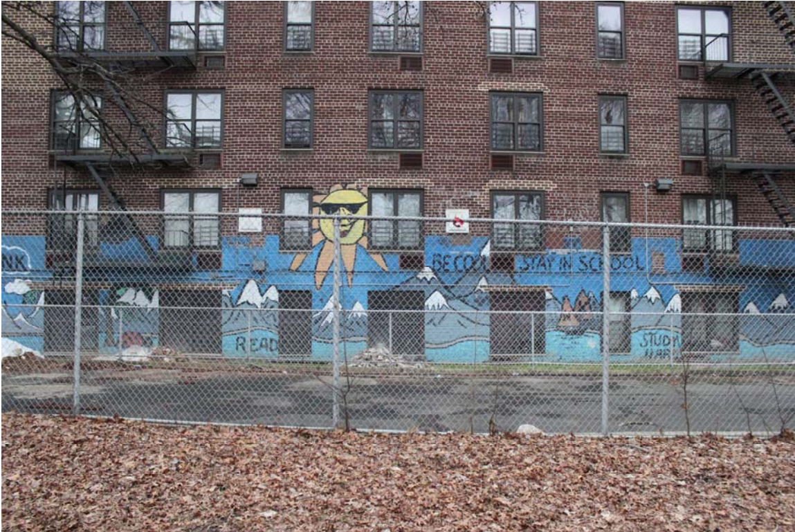
Figure 4. A basketball court and a sunny mural decorate the Park Hill housing blocks.

such seems more an effort to condition the refugee to the United States' political-economic climate and system of labor-capital relations rather than an attempt to improve the refugee's neighborhood-level lived experience.