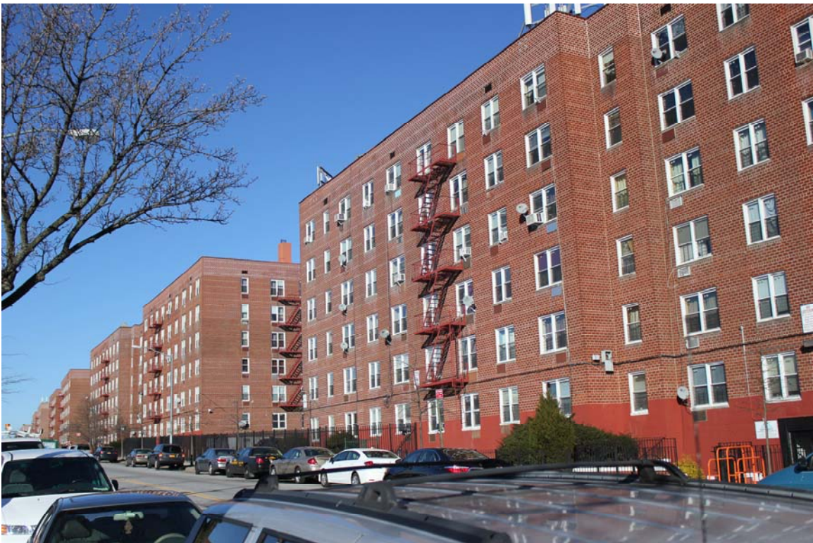
Figure 1. The brick blocks of Park Hill Avenue.

As the world's displaced continue to step through the doors of its cities in numbers not seen in recorded history, planners have an obligation to consider refugees as we reimagine the neighborhoods and paradigms in which we work. While the few refugees who resettle in the United States may be considered on a global level to be fortunate, resettlement systems which have been put in place in the twentieth century have left much of the work of integration to chance. This study aims to identify neighborhood factors which may contribute to a welcoming community for refugees and therefore create greater community integration. An evaluation of physical and social factors on the ground in the Liberian community in Staten Island, combined with personal experiences of resettlement informs the recommendations at the conclusion of this study.