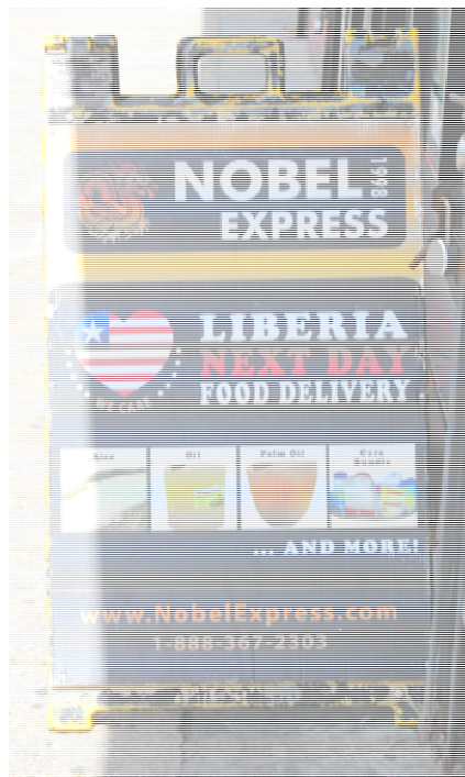
Figure 6. Supreme Sportswear offers many services aside from clothing provision, such a food delivery in Liberia.

Beyond the provision of clothing by African Refuge and New York Cares, however, here sits at least one successful clothing shop on Targee Street, right in the center of the unimpressive block of shops. “Supreme Sportswear,” its two signs (different in style and in finish) proclaim from above the windows. It is the only clothing store in the area. Yet advertisements for sportswear may be the least convincing prospect of the establishment: the displays of running shoes and winter gloves and rain jackets are obscured by a cacophony of signs set up on sandwich boards on the sidewalk and pasted onto the windows. “International Pinless Calling,” one board proclaims, allowing those in this country to purchase phone credit for family members’ numbers back home; “Liberia Next Day Food Delivery” says another, enabling refugees to pay for their loved ones’ food in Liberia; a third shouts “Utility Bills Paid Here” underneath an advertisement for Moneygram, the ubiquitous transfer service used widely for sending remittances.