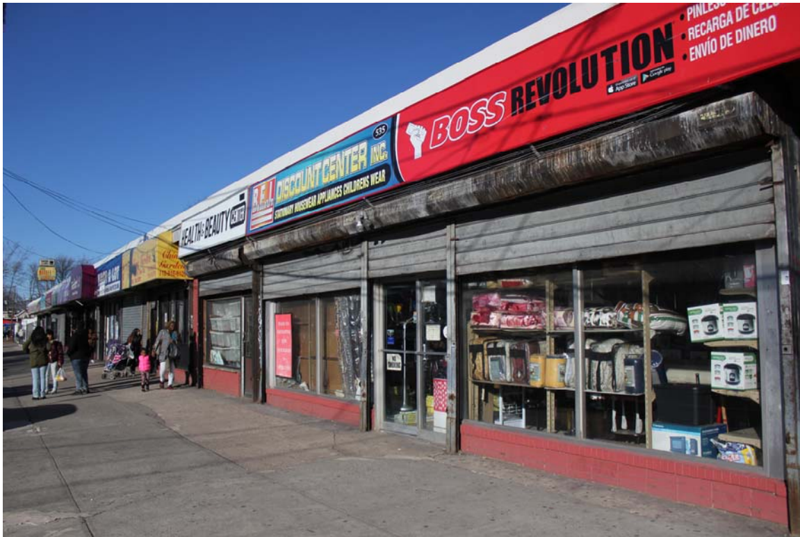
Figure 7. Park Hill's commercial center on Targee Street.