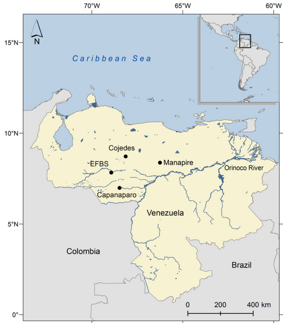
Fig 1. Location of the El Frío Biological Station (EFBS), and three additional localities where last remaining populations of Crocodylus intermedius are found in Venezuela.