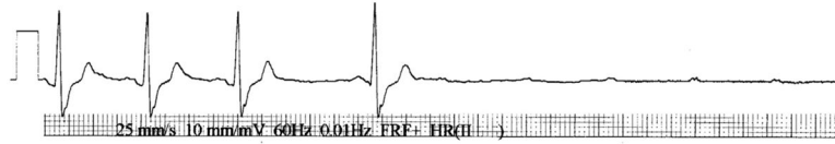
Fig. 2. Rhythm strip (lead II) of a heart transplant patient with complete heart block with ventricular asystole, recorded 20 seconds after atropine was administered during dobutamine stress echocardiography.