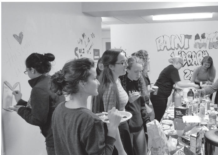
Students getting snacks and paint at Paint Night.