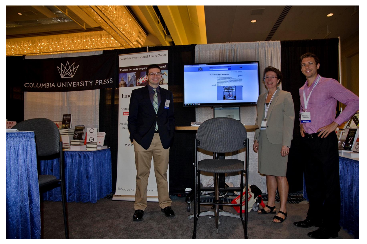
American Political Science Association Annual Conference, September 2015