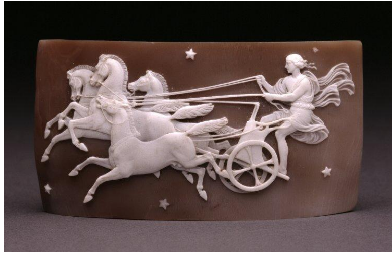
Figure 10 Phaeton Driving the Horses of the Sun , carved by Tommaso Saulini after design by John Gibson, after 1850. Shell cameo, 10 x 5 cm. London: British Museum.

was commissioned in marble by Earl Fitzwilliam. The shell cameo was exhibited at the 1862 International Exhibition. Two surviving shell cameos are located in the British Museum and Saulini family collection. Gere and Rudoe have suggested that this cameo would have been worn in a diadem or comb mount because of its weight. 110