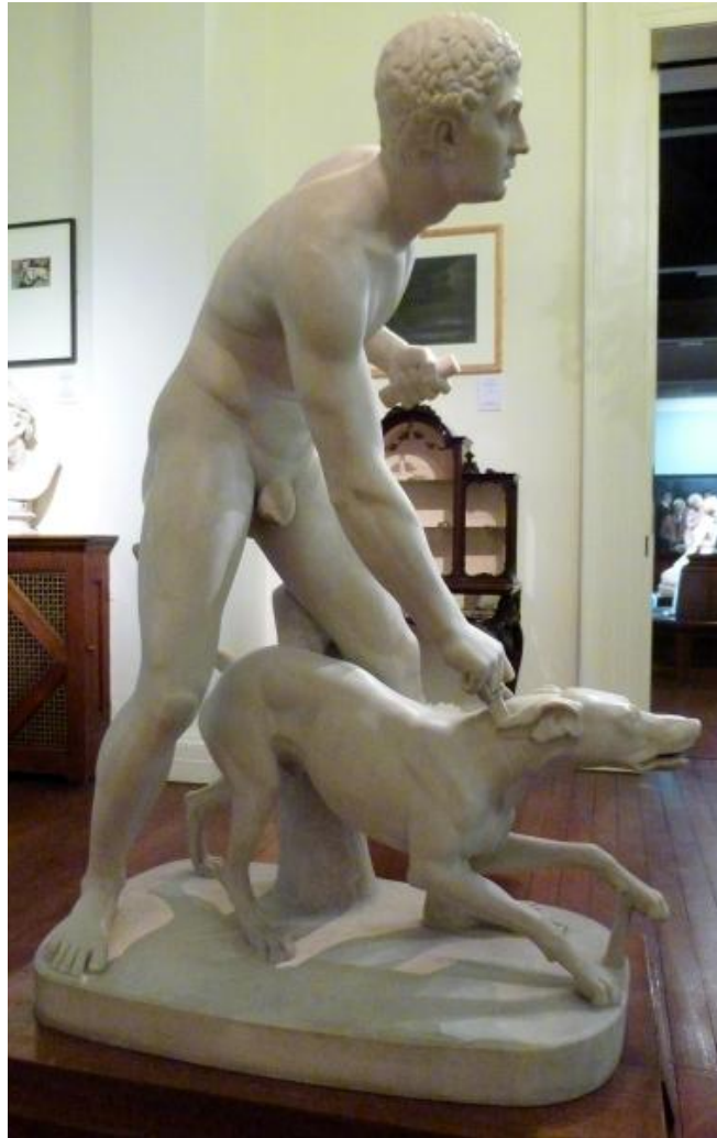
Figure 8 John Gibson, The Hunter and His Dog, modeled 1840-41, commissioned 1847. Marble, H. 119.7 cm. Lincoln: Usher Gallery.

celebrated the craft of sculpture as technological innovation, it was ultimately equated to a form of the industrial arts and not a fine art. Thus, for Gibson to have identified himself exclusively as a 'sculptor' would in his mind have limited the appreciation of his art. In choosing to call himself a 'designer', Gibson was able to exploit other forms of craftsmanship beyond that of sculpture's plaster casts and marble. These included Parian ware statuettes and cameos based on his designs, which were on display elsewhere in the Crystal Palace.