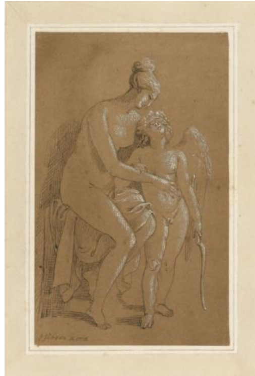
Figure 6 John Gibson, Venus and Cupid, no date. Pen and ink with white gouache on paper, 15 x 9.5 cm. London: Royal Academy of Arts.

Some of Gibson's friends remarked in their memoirs about his talents in draftsmanship, most notably with studies for bas-reliefs. For instance, the Scottish-born scientist and mathematician Mary Fairfax Greig Somerville, who first met Gibson during a tour of Rome in the mid-1830s, noted of his draftsmanship: 'His drawings for bas-reliefs were most beautiful. He drew very slowly, but a line once drawn was never changed. He ignored India-rubber or bread-crumbs, so perfect was his knowledge of anatomy, and so decided the character and expression he meant to give'. 65 The writer Susan Horner wrote admiringly in her journal that, upon visiting his studio, 'he showed a beautiful drawing he is making, ... very well executed', and afterward, when she visited the Vatican with him, he became 'occupied making a drawing for a bas relief of Hyppolitus', studying closely sea monsters in a Greco-Roman mosaic floor. 66 The majority of Gibson's drawings remaining in his Roman studio were bequeathed to the Royal Academy and these