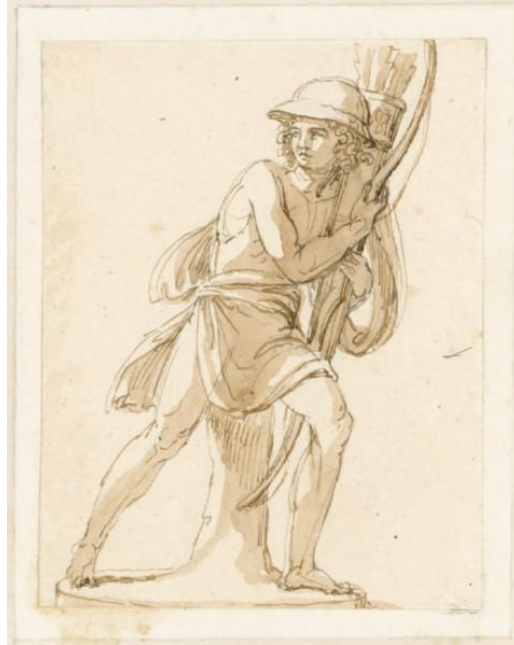
Figure 3 John Gibson, Study for Cupid Disguised as a Shepherd Boy, undated, before 1837. Pen and ink and wash on paper, 7.2 x 5.7 cm. London: Royal Academy of Arts.

god the height of an adolescent. He hides in his left hand behind him his 'heart-piercing dart' and his bow, the bottom portion of which rests against his calf. 28 Four of the known repetitions of the statue show his right hand reaching outward, the fingers slightly curved as if to take someone's hand, inspiring 'confidence' yet assuming 'that air of modesty and timidity to conceal the more his cunning designs', as Gibson described it. 29 However, in the two earliest repetitions of the statue, he is shown holding a rose in his right hand, which may have been intended to enhance his flirtatious nature. No documentation has yet explained this change in the outstretched hand.