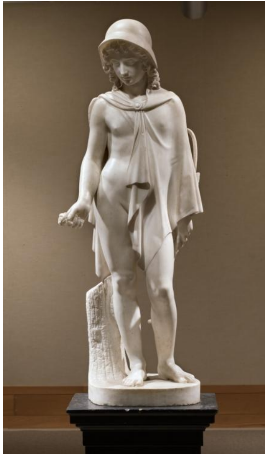
Figure 2 John Gibson, Cupid Disguised as a Shepherd Boy , modeled c. 1830, commissioned 1834. Marble, H. 129.5 cm. New Haven: Yale Center for British Art.

Of all the sculptures in Gibson's oeuvre, however, Cupid Disguised as a Shepherd Boy (Fig. 2) arguably serves as the best example of artistic reproduction within the sculptor's studio. This work was his most popular subject, with at least nine versions commissioned in marble by patrons. Gibson first began working on the subject around 1830, and it was his belief that he had created a new interpretation of the god of love, although the figure was inspired by classical and