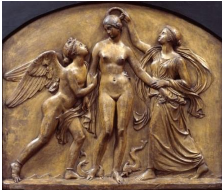
Figure 5 John Gibson, The Birth of Venus, c. 1840. Plaster, 59 x 67.3 cm. London: Royal Academy of Arts.

And from this design there was always a product, whether it was a plaster or marble statue made in his studio, or a porcelain statuette, a cameo, or a print made by others taken from his design. Some of Gibson's designs, such as The Birth of Venus (Fig. 5), were executed as a drawing, print, plaster cast, and cameo, but not in marble, and the lack of this 'final' version did not diminish the importance of his design.