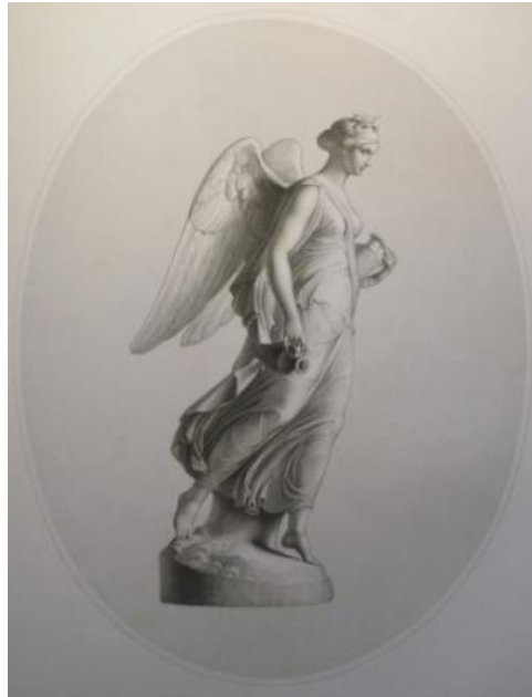
Figure 14 Aurora , from the Art journal , September 1849, engraved by William Roffe after John Gibson.

This description allowed the viewer the possibility of imagining the sculpture in a domestic interior, but it also suggested how one could frame the print and hang it on a wall with a similar background color and gold frame to enhance the experience of what the sculpture itself must look like in person. Considering Gibson's rising interest in polychrome sculpture by this time, the emphasis in this article on the harmonizing of white marble in the decorative interior seems prescient. Having a work engraved as a fine-art print by the Art journal , however, did not necessarily exempt the artist or the subject from critique. In the same text, the author criticized Gibson for his failed attempt at successfully managing in stone what was clearly an otherworldly subject.