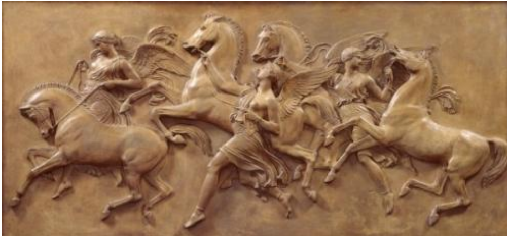
Figure 7 John Gibson, The Hours and the Horses of the Sun , 1847-48. Plaster, 100 x 216.2 cm. London: Royal Academy of Arts.

There were two works of sculpture on display in the Sculpture Court of the Crystal Palace to which Gibson's name was assigned. The first was a bas-relief in plaster of The Hours and the Horses of the Sun (no. 64; Fig. 7), the marble version of which he had recently completed for the Earl of Fitzwilliam and exhibited at the 1849 Royal Academy, where it was praised for its 'exquisitely classical feeling' in that the movements of the animals and figures 'form a composition in the purest feeling of the antique'. 72 A large work measuring 7 ft. in length, the bas-relief had been highly touted in the press from its creation in Rome a few years earlier. 73 It was with this plaster that he identified himself as 'designer'. His second work was the marble statue of The Hunter and His Dog (no. 80; Fig. 8), but this was a submission by its owner, the Earl of Yarborough, and not Gibson. Of these two works, his statue of the Hunter earned him greater acclaim, including the distinction of being named for the Council Medal, the highest award possible. 74 This association of Gibson's name with a plaster cast (as designer) and a marble statue (as sculptor, even though he did not literally carve it) becomes even more important when seen in the context of the Great Exhibition itself. At an international fair that