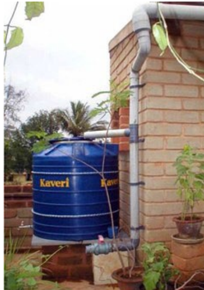
Figure 3: Basic system design; a basic rainwater harvesting system, such as the one pictured above, can be built of basic materials for the equivalent of $60, depending on local costs and system size; the main technical requirements are an impervious roof and room for a cistern or tank.

alternative options, such as buying water from vendors, may be more expensive or time consuming than even expanded rainwater harvesting systems 23 .