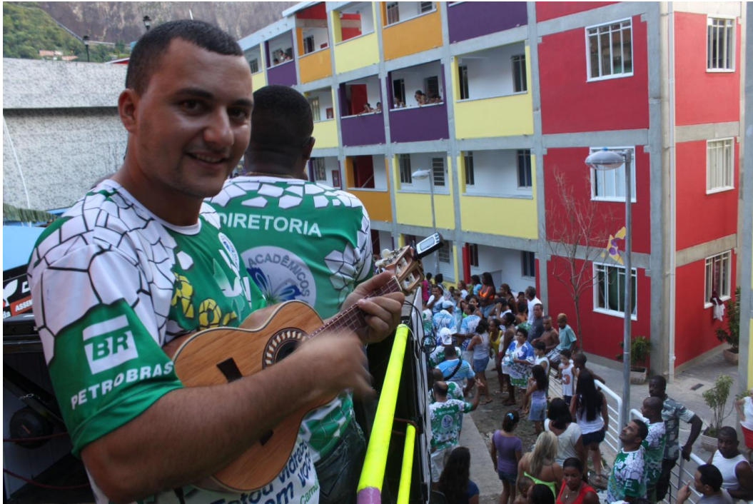
Photo 7. The Project has no boundaries, and neither have the people of Rocinha. At each step, we realize how curious and eager to learn people from the favela really are. I live in a place where more than one hundred thousand people have the potential to shine.