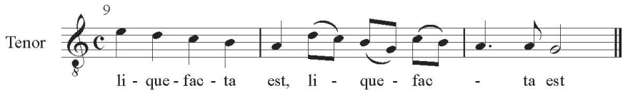
Example 1: Alba Tressina, Anima mea liquefacta est : Tenor, mm. 9–11.

Apart from the text, Tressina's musical setting similarly makes use of techniques and conventions common within sacred–erotic musical composition. One of the more striking musical techniques still part of the Italian musical landscape in the early decades of the seventeenth century is textual mimesis: the close relationship composers crafted between a given text and the musical “translation” of that text, often depicting the meaning of the text both visually and aurally. 14 The mimetic style that Tressina employs in this piece is straightforward and uncomplicated, yet vital to the piece's sacred–erotic theme: her melodic lines imitate the movement (and perhaps the sound, as well) of flowing water. During the first thirty–two measures, phrases melt into one another, cascading down the staff like a waterfall, spilling from voice to voice over a descending octave. These watery characteristics are paired with the first line (“Anima mea liquefacta est”) and intensify on the word liquefacta , which for more than half of its nine iterations is set to pairs of descending fusae (see Example 1).