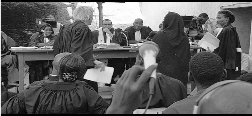
Figure 8. “Shut up”

When he addresses the court, the men active in the village world of unofficial microgovernance (please contrast this to world governance), disconnect the loudspeaker, also without waiting for procedure.