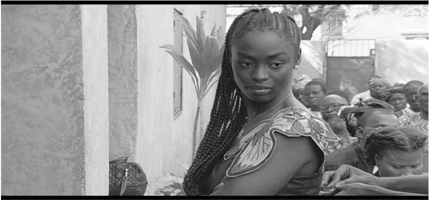
Figure 1. Singer interrupts film to have bustier laced

the charismatic female singer who would travel easily into the musical circle of global protest and the traditional healer. The name of the film appears on the screen after those two placings outside of the work.