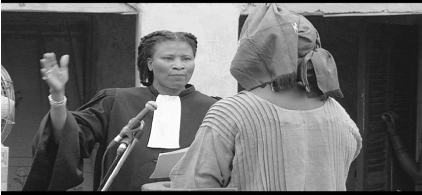
Figure 5. Black woman testifying

Then the traditional healer, who finally intervenes, out of place. This is an undecidable moment, the moment of a double bind. For, if Mamadou Diouf is right, the Africans here do not necessarily understand what he sings. It may indeed be a procedural complaint on his own behalf. The response is mysterious, a pattern of close-ups of individual faces. We contemplate the distinction between singularity—repeatable difference—and the individual subject.