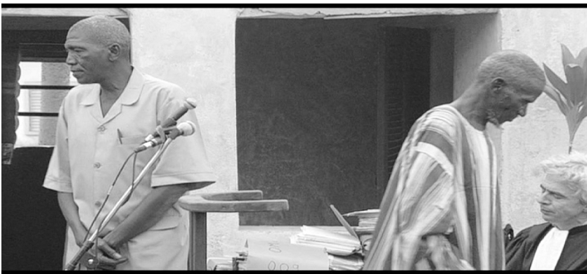
Figure 2. Healer leaves trial

Here is the woman singing simply to show her forceful presence in the film. Indeed this bit is used to promote the film—although it is not part of the trial, where the participating Africans have achieved sufficient continuity with the European Enlightenment to be able to criticize its travesty: