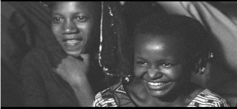
Figure 7. Innocent response to African Western

in the mother and daughter is remote indeed from a critique of Western benevolence, from a social position in society within that enclosure, as represented by the “educated” Africans participating in the trial.