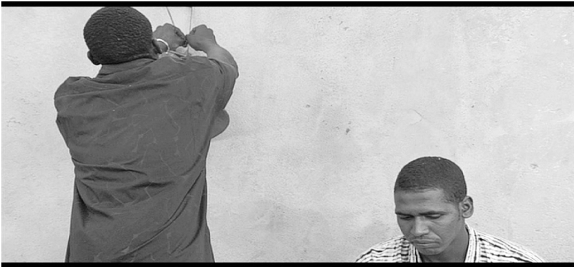
Figure 9. Africans disconnect loudspeaker

When he addresses the court, the men active in the village world of unofficial microgovernance (please contrast this to world governance), disconnect the loudspeaker, also without waiting for procedure.