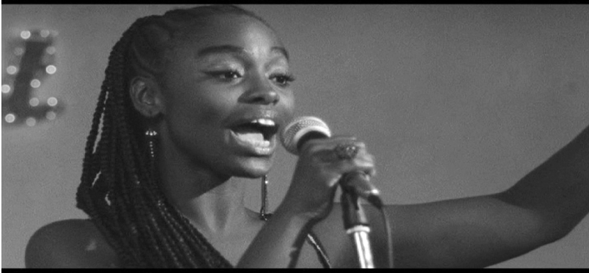
Figure 3. Singer's dynamism

Now to images where, in the film, Sissako distinguishes carefully between the difference in the response.